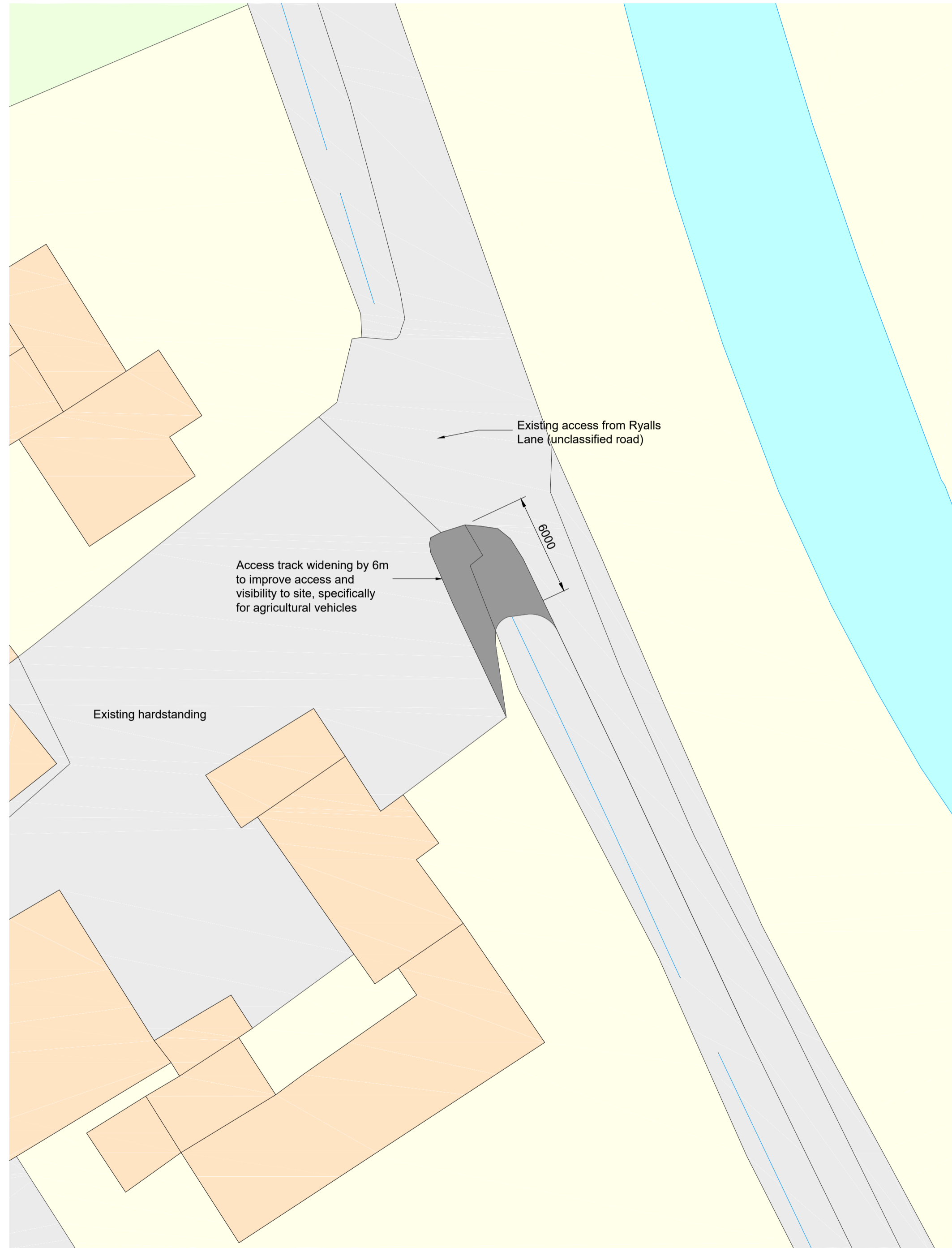
Proposed Block Plan SCALE 1:200