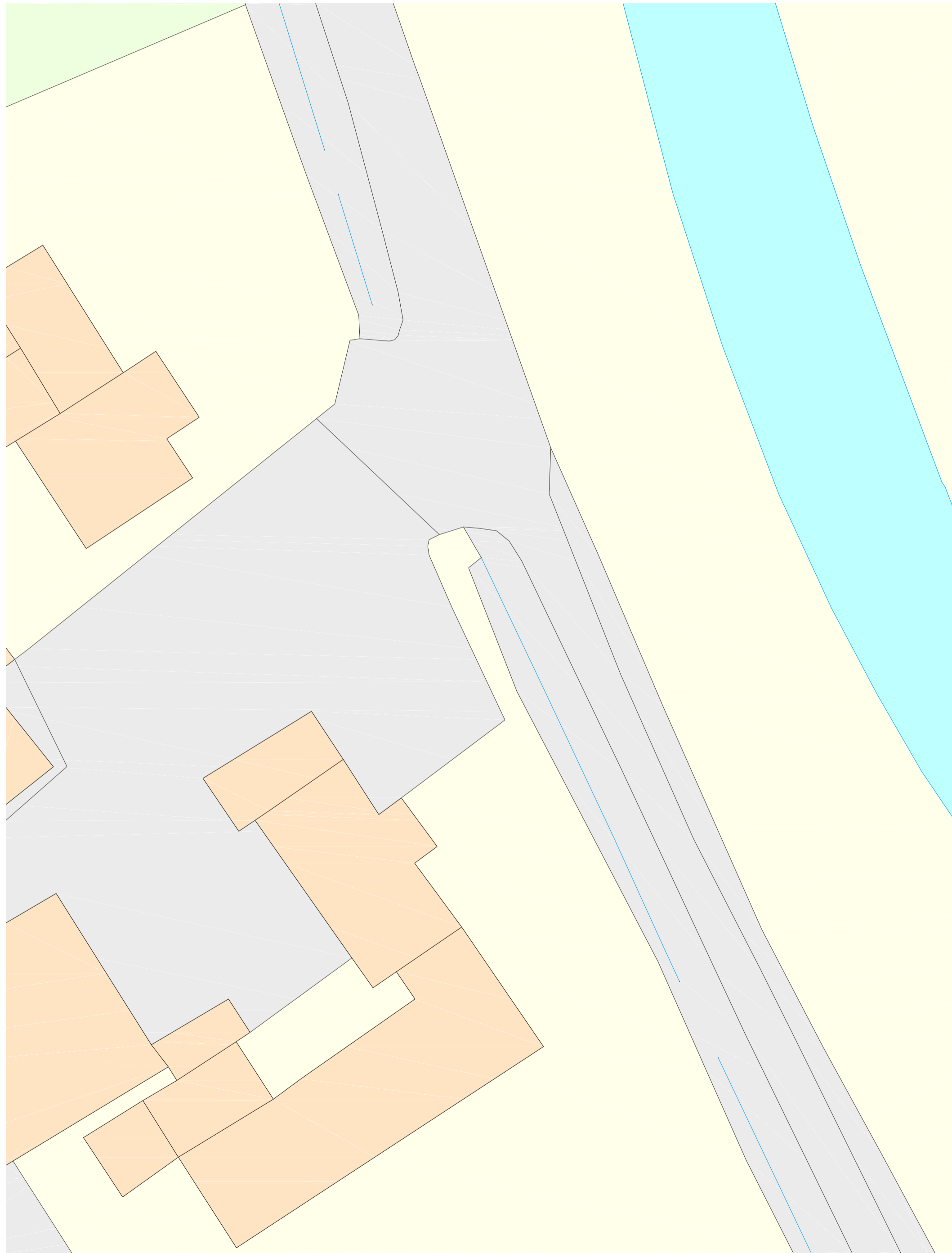
Existing Block Plan SCALE 1:200