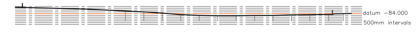
SECTION A-A - EXISTING