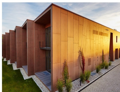
Feature Cladding - Rockpanel Natural