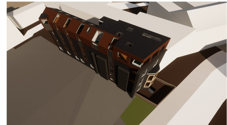
Aerial Looking South East