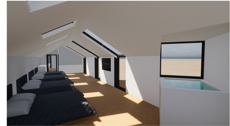
Apartment 9 Interior