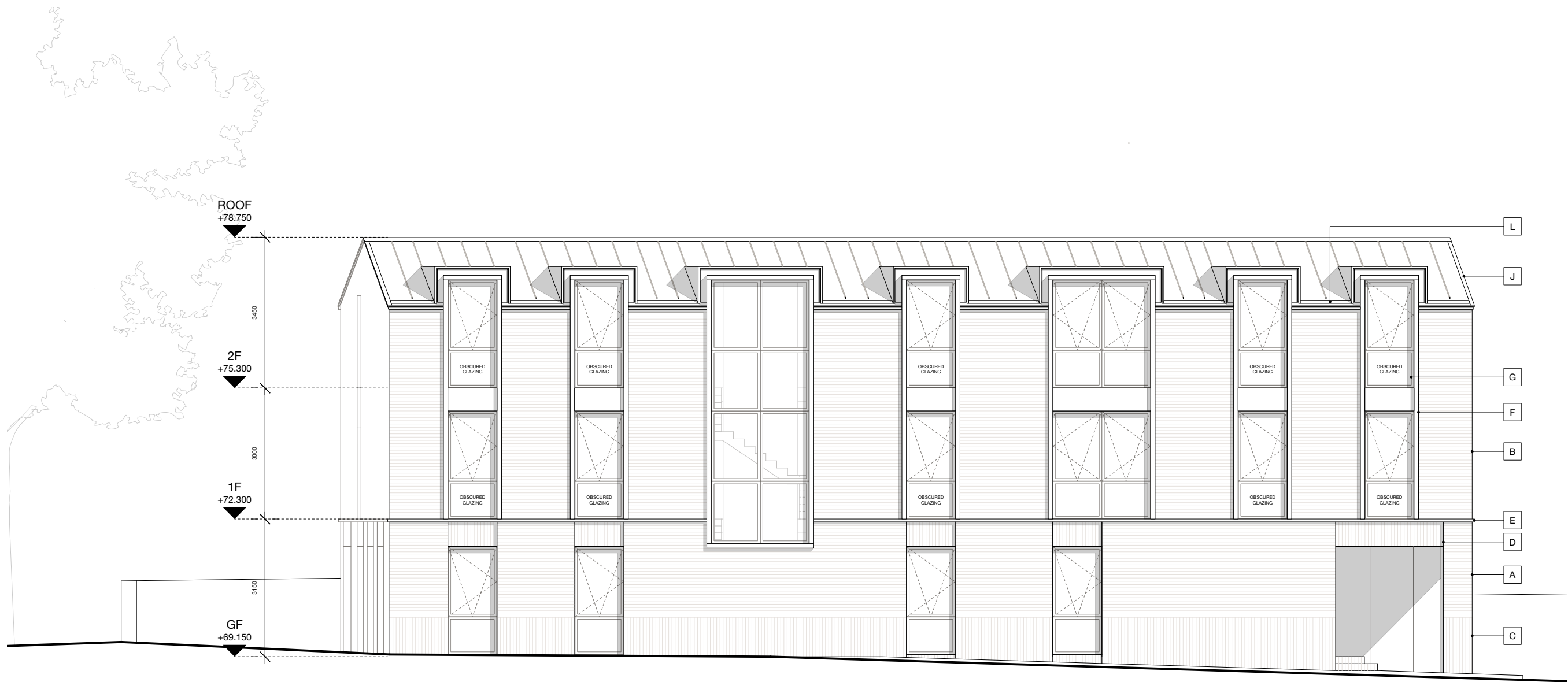
PROPOSED NORTH ELEVATION - 1:100 @ A3