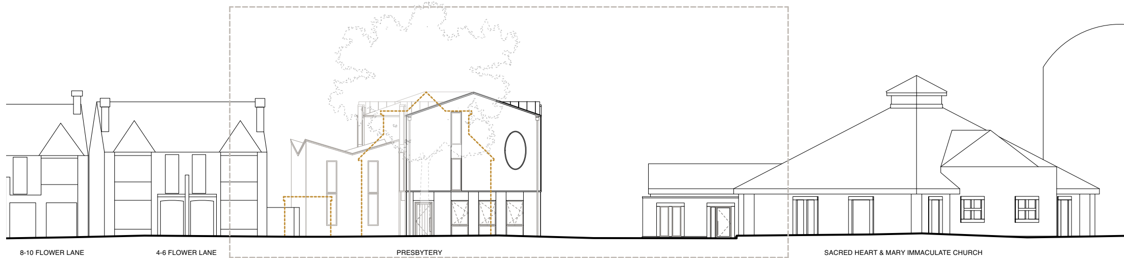
PROPOSED EAST CONTEXT - 1:250 @ A3