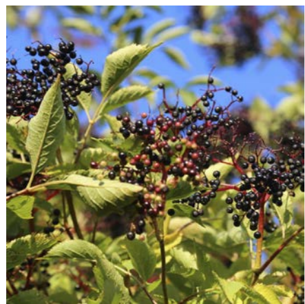
1 - Opportunity for mature fruit tree at site boundary