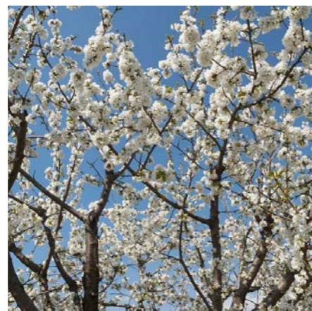
2 - Opportunity for ornamental flowering tree within courtyard