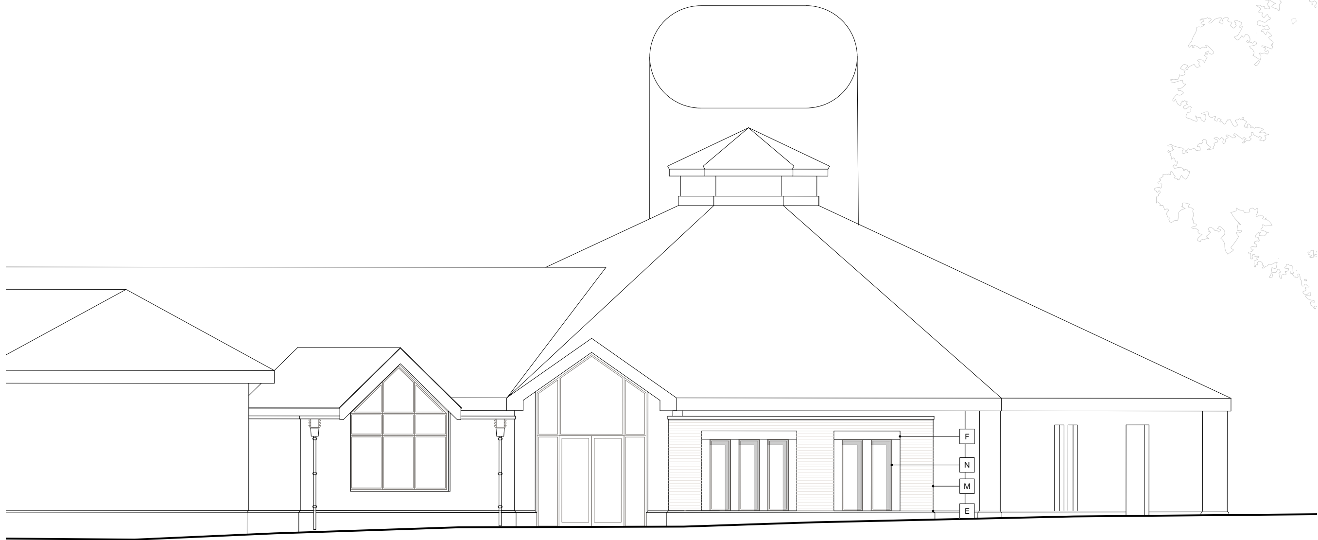
PROPOSED SOUTH ELEVATION - 1:100 @ A3