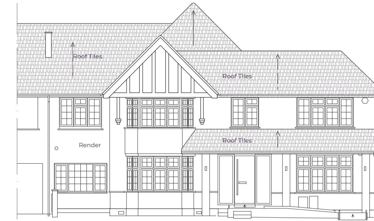
Existing/Proposed Front Elevation