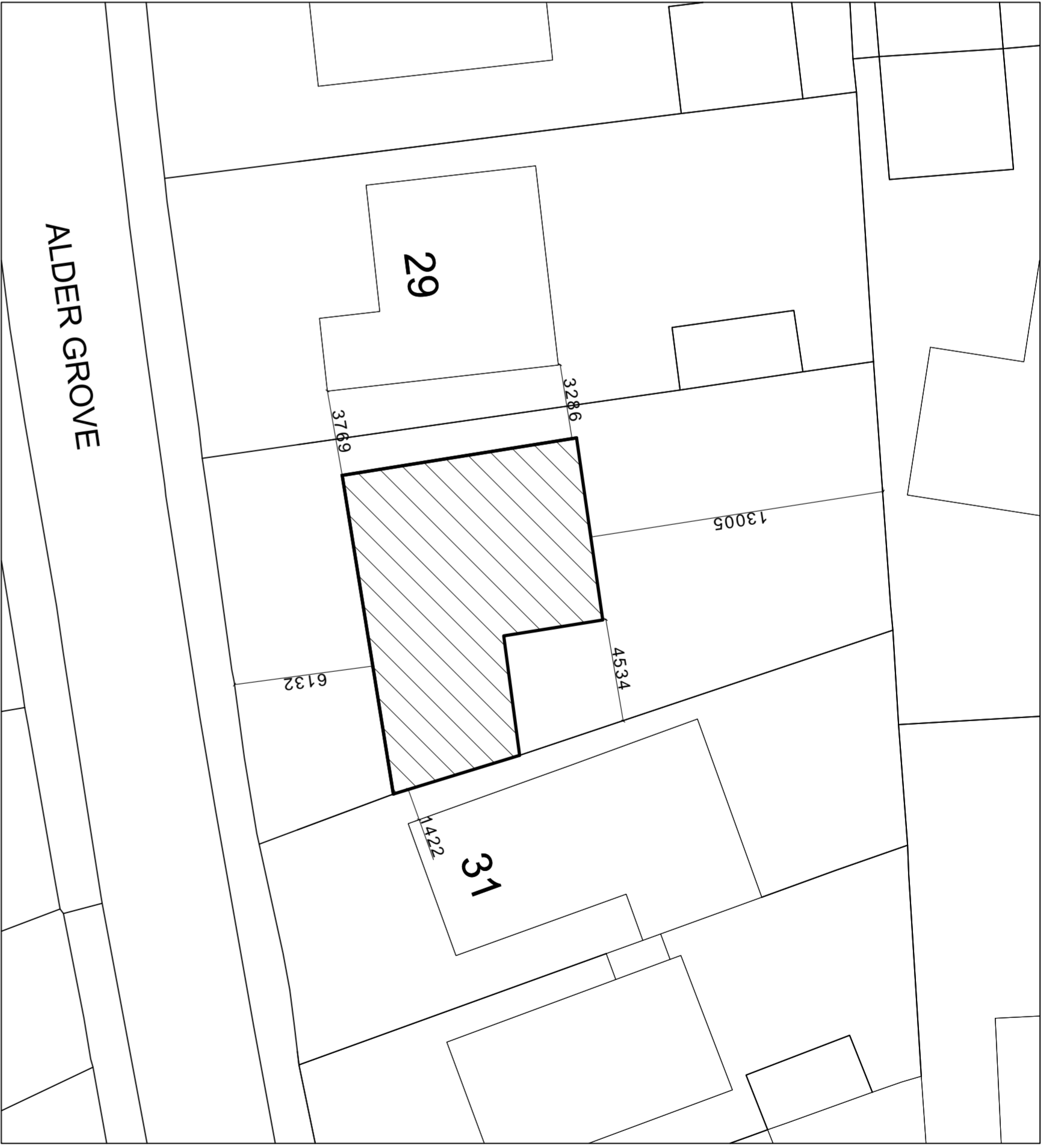
SITE CONTEXT SCALE 1:200