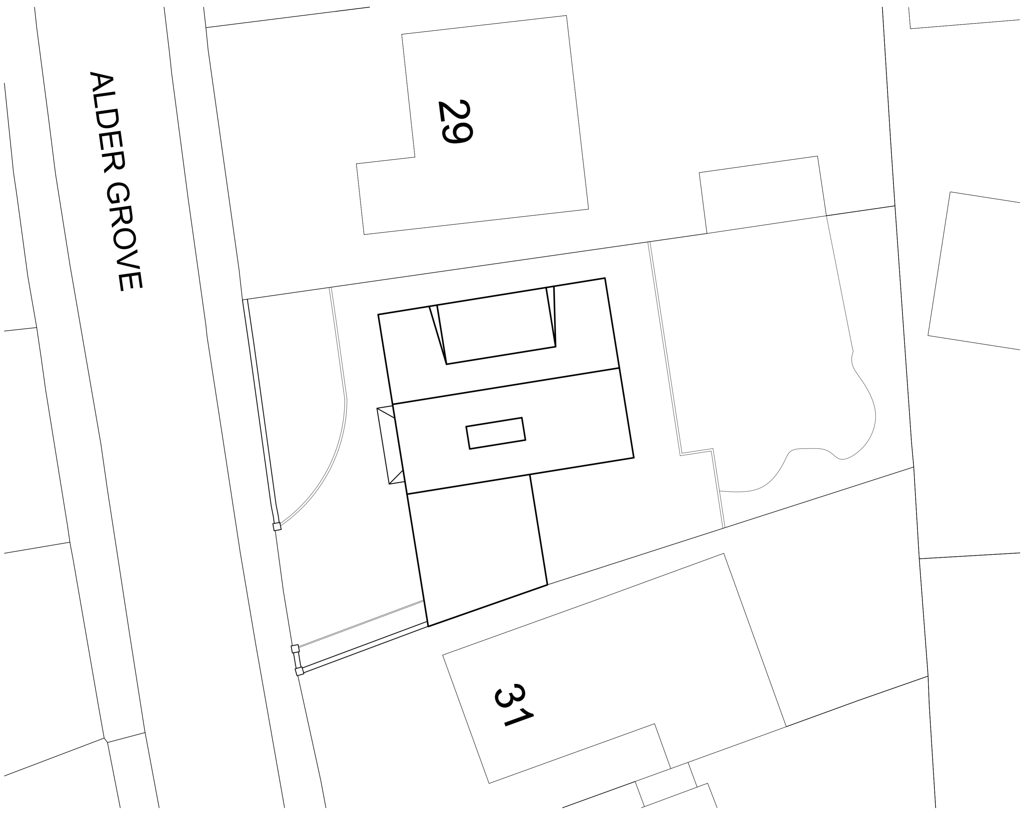
SITE GENERAL ARRANGEMENT SCALE 1:100