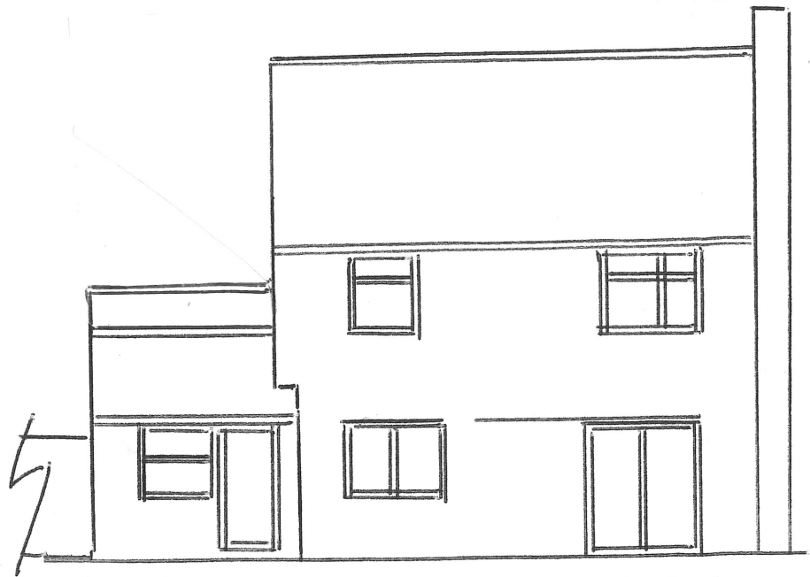
REAR ELEVATION SCALE 1:100 EXISTING (NORTH)

Reference D 1/183/21 Proposed roof terrace Mrs C S L Liggett 7 Heather Close Gosport PO13 0BG