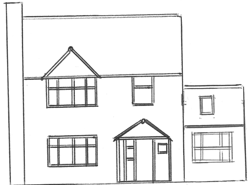
FRONT ELEVATION SCALE 1:100 (WEST) EXISTING.