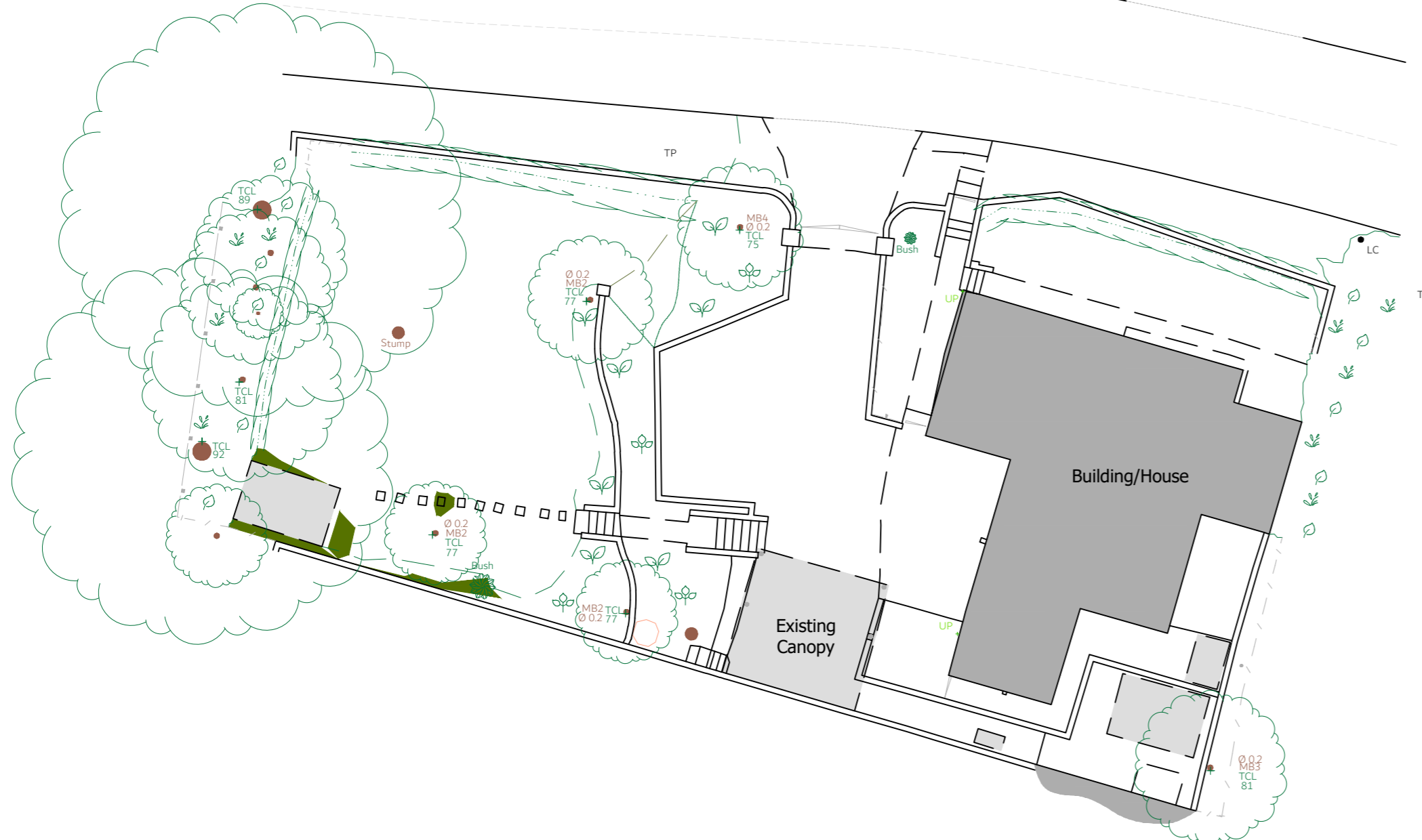
Existing plan 1:200