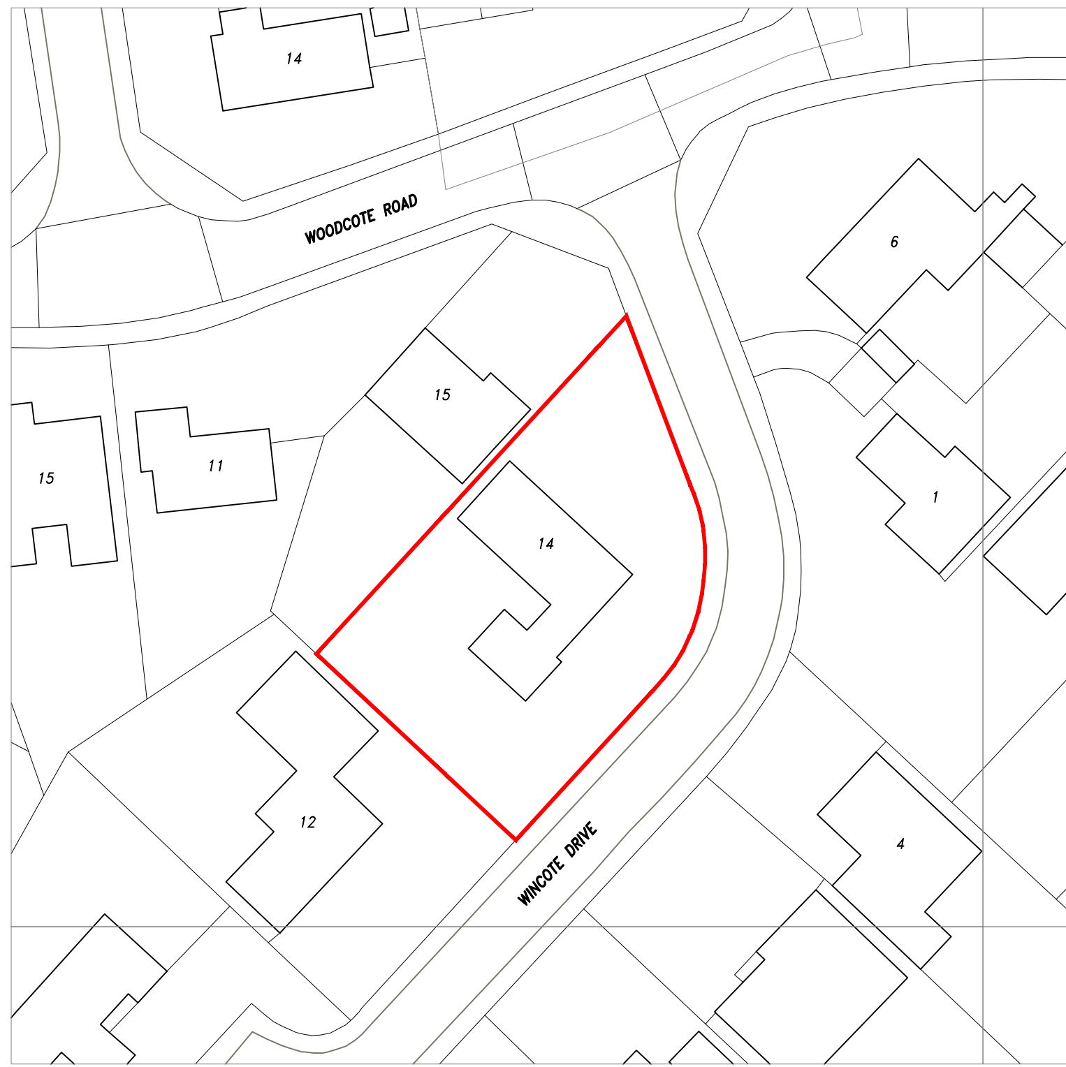
Block Plan (1:500)

© Crown Copyright and database rights 2021 OS 100035409