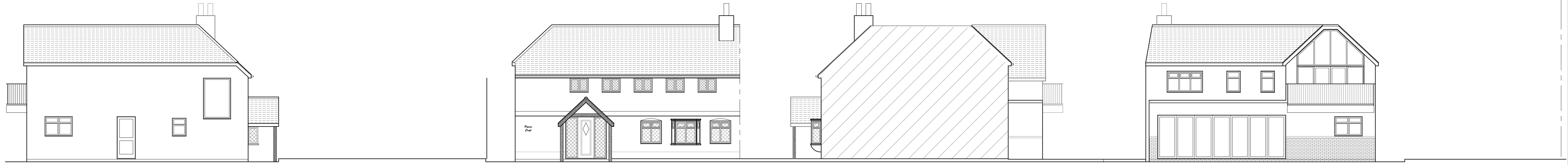
Proposed Side Elevation Scale 1 : 100