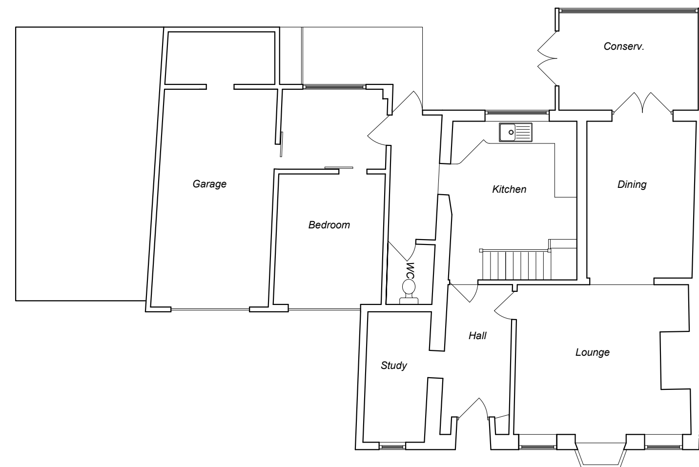
Existing Ground Floor Plan Scale 1 : 100