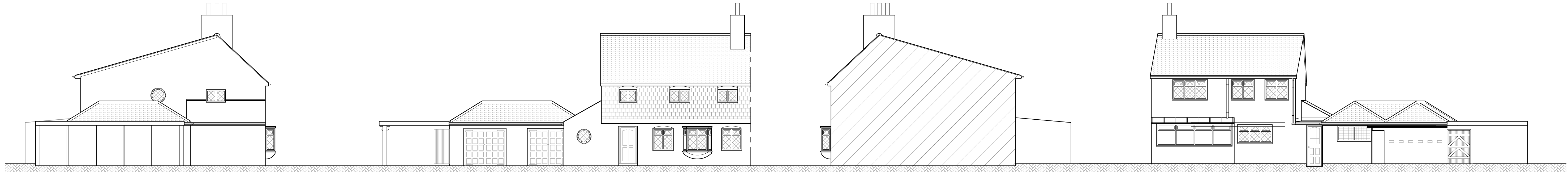
Existing Side Elevation Scale 1 : 100