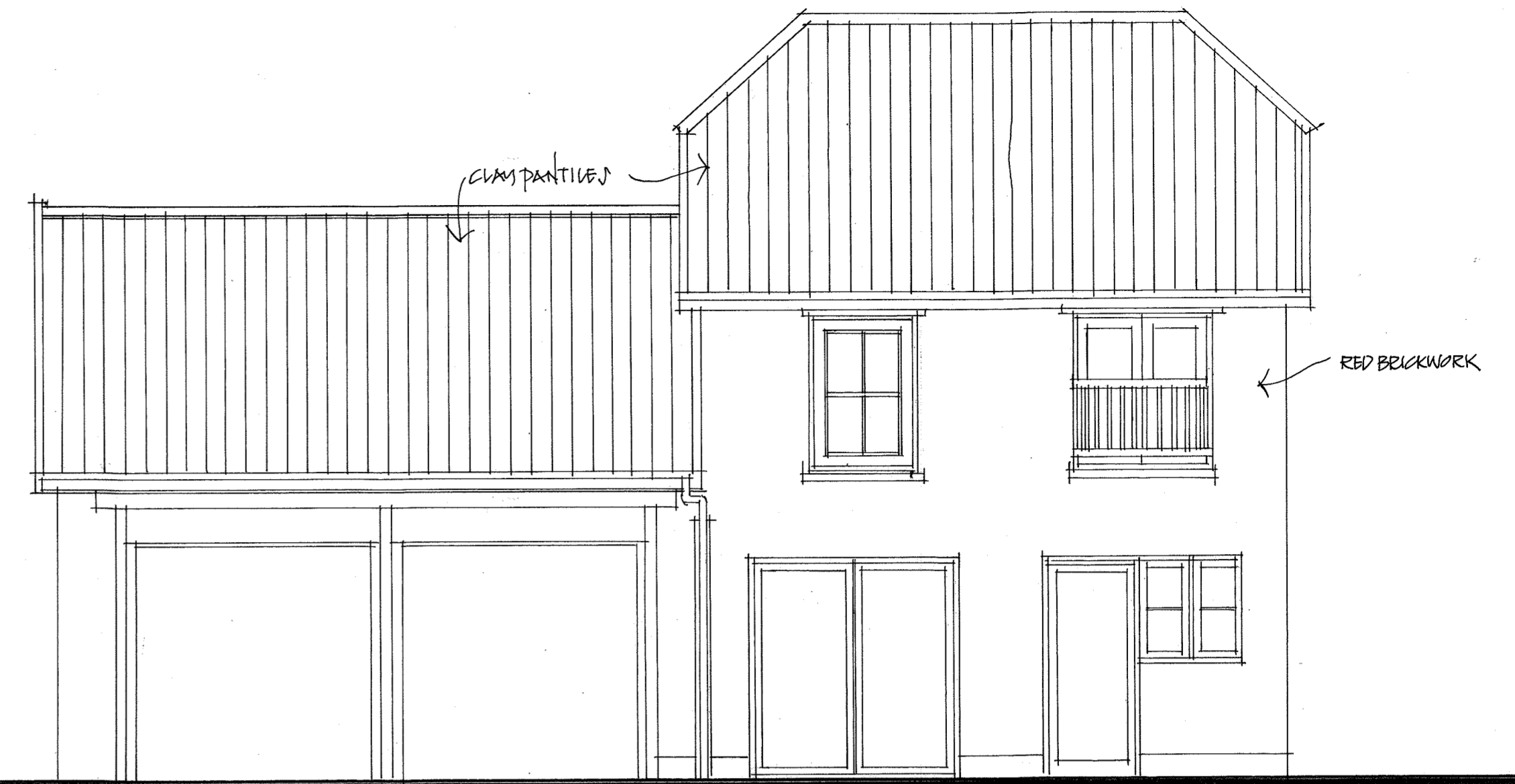
FRONT & SOUTH ELEVATION 1:50 AS EXISTING