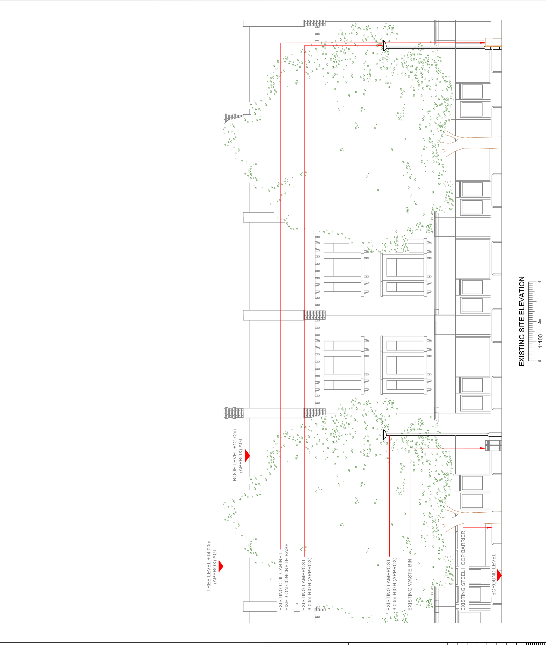
EXISTING SITE ELEVATION