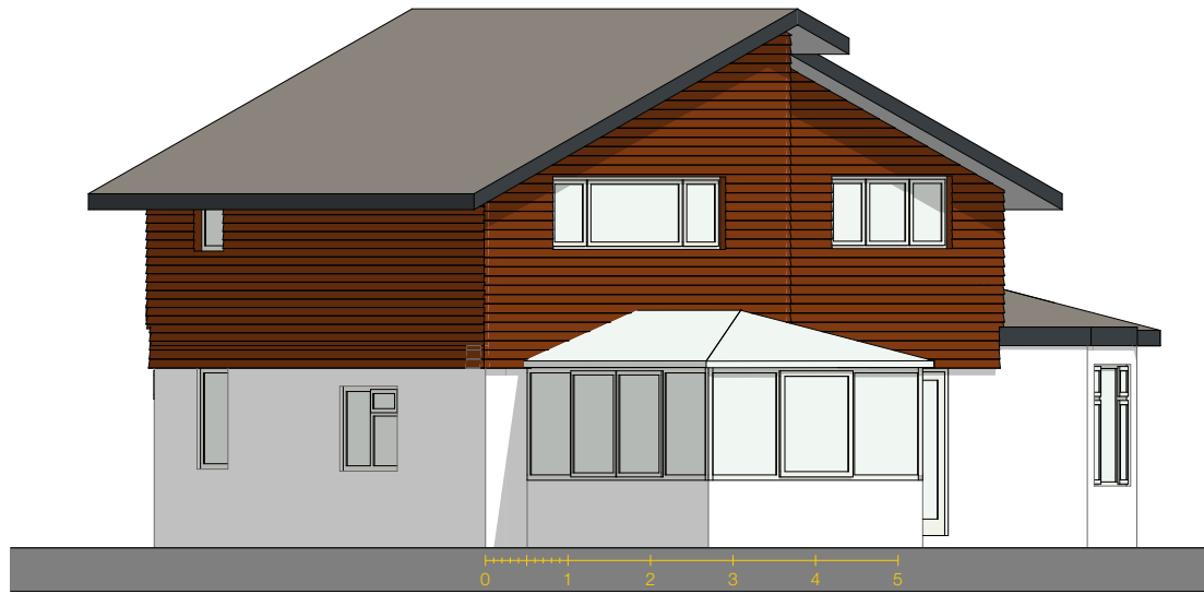
E-02 Existing West Elevation 1:100