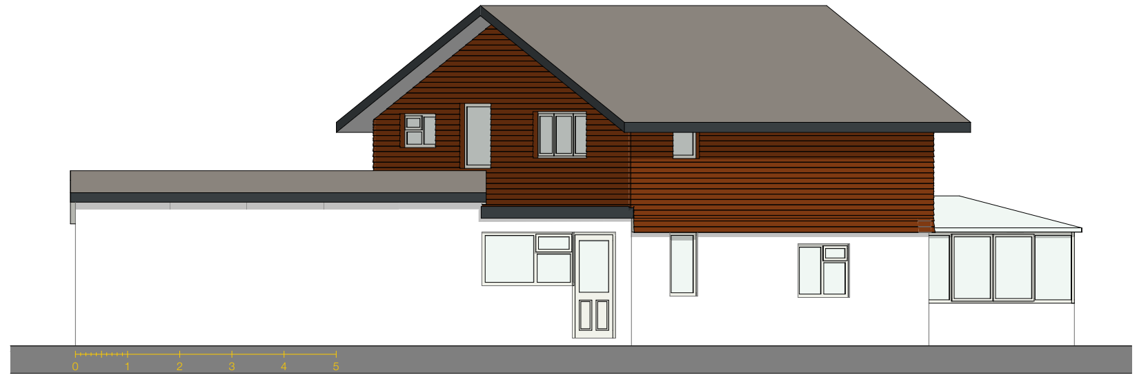
E-03 Existing North Elevation 1:100