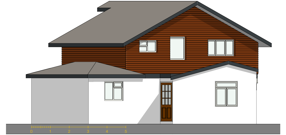
E-04 Existing East Elevation 1:100