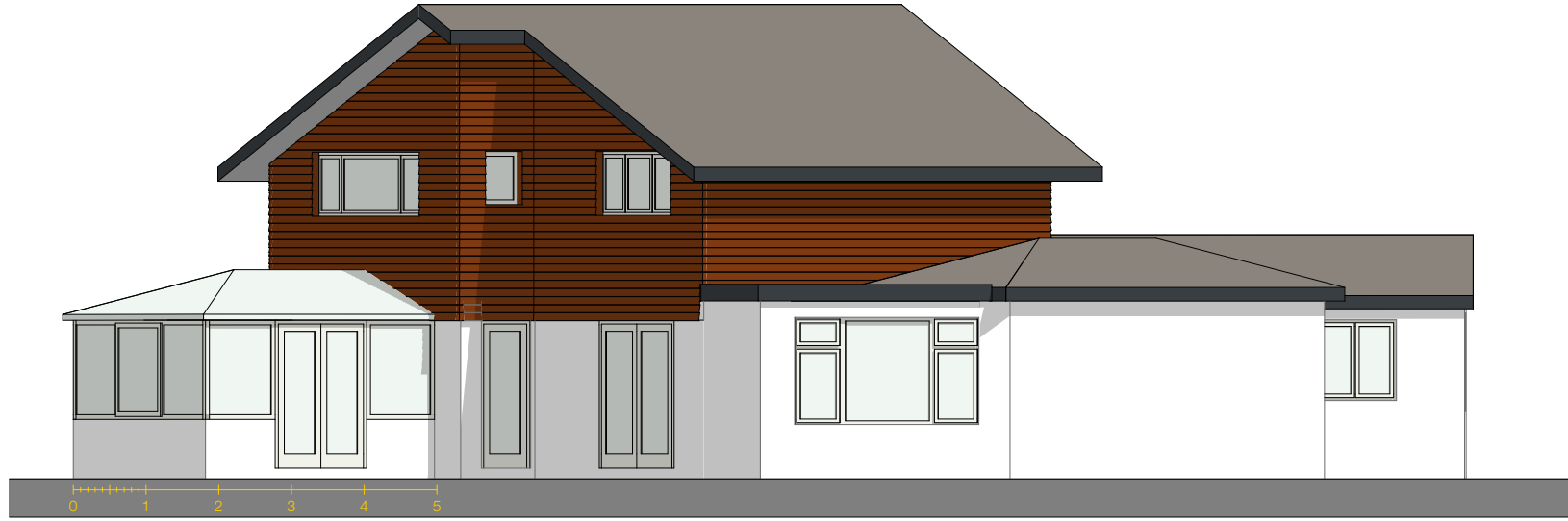
E-01 Existing South Elevation 1:100