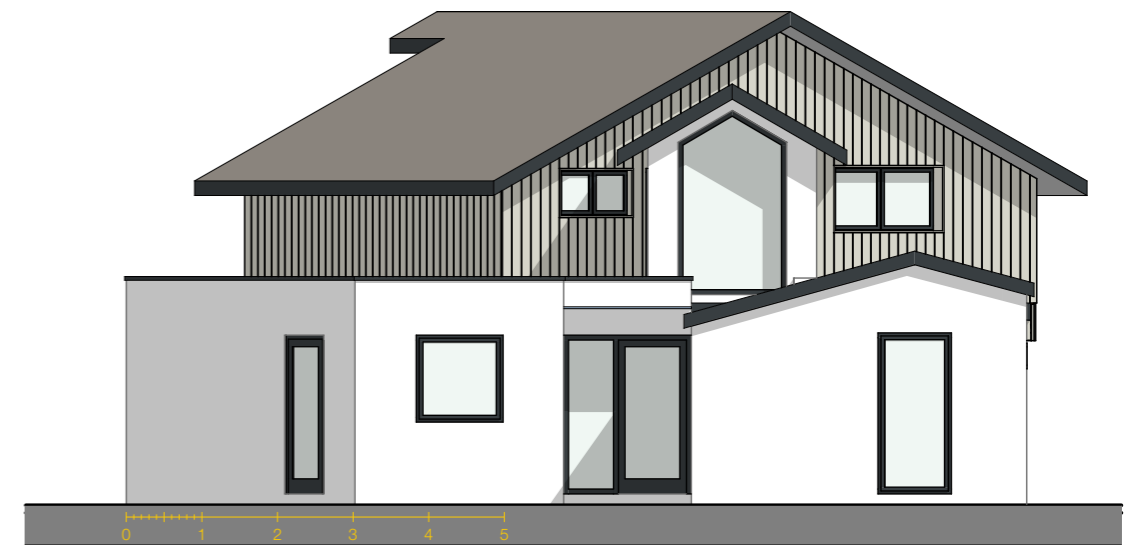
E-04 Proposed East Elevation 1:100