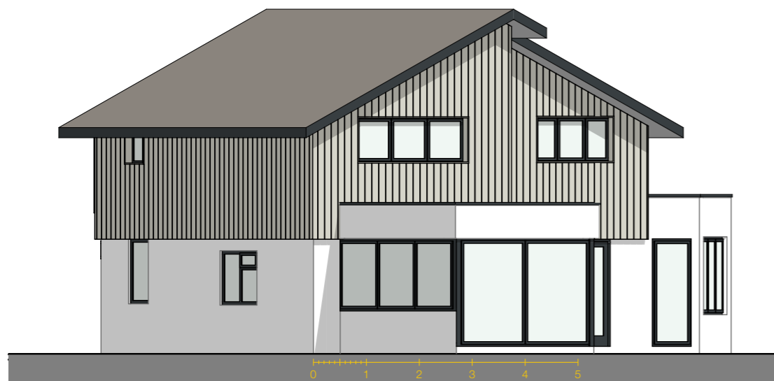
E-02 Proposed West Elevation 1:100