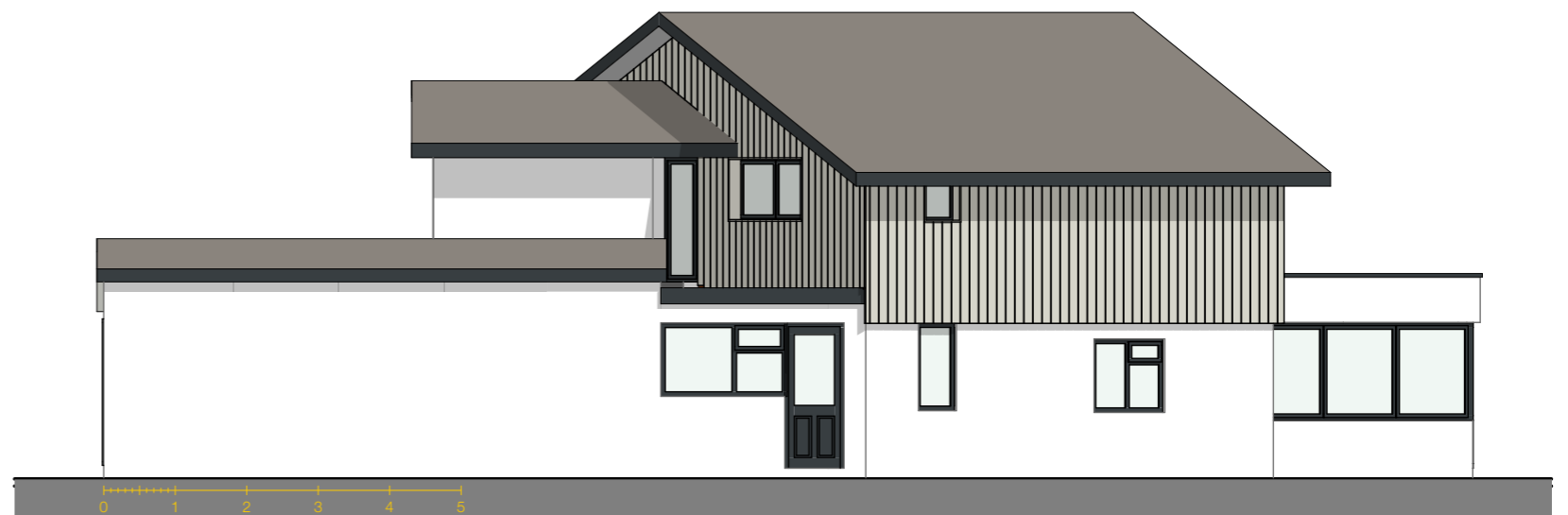
E-03 Proposed North Elevation 1:100