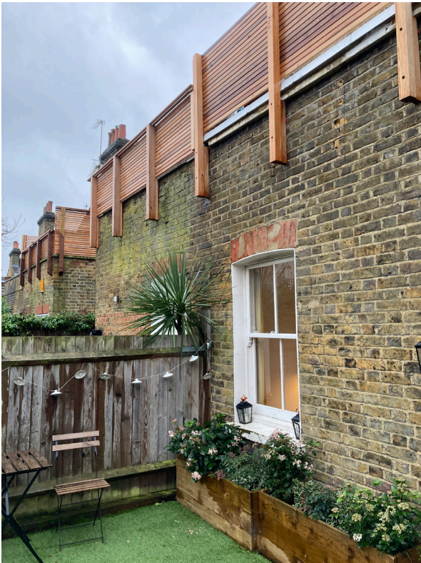
5 - Rear courtyard and boundary to 17 Mandalay Road