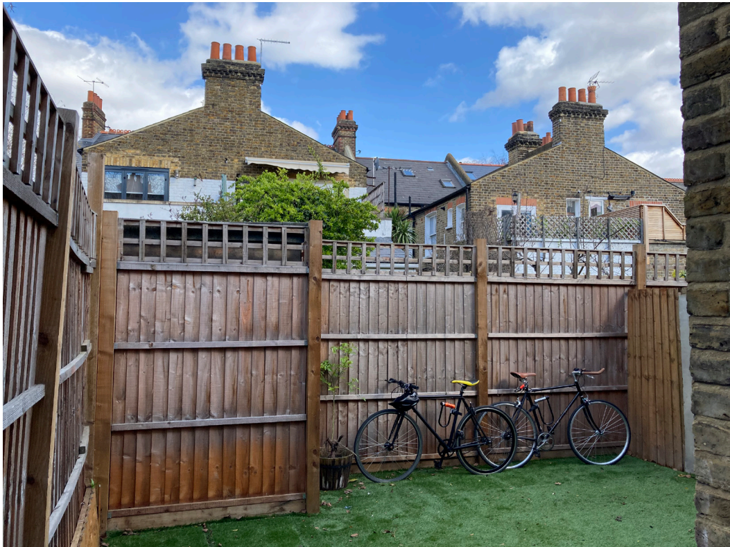
3 - Rear boundary to properties along Hambalt Road