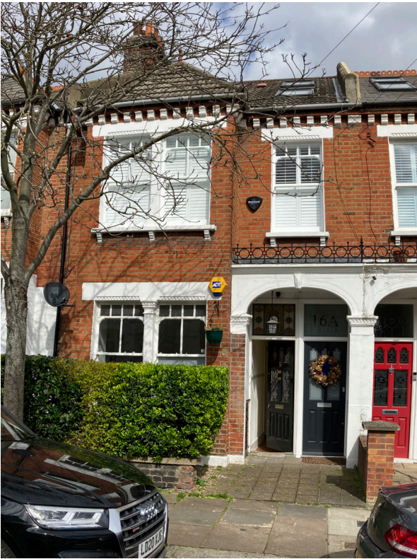
1 - Front facade and access to the property