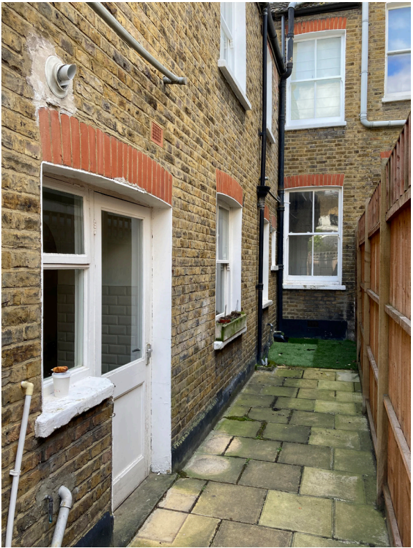
2 - Rear side courtyard