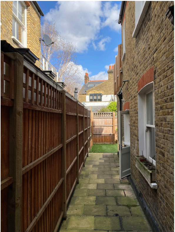
6 - Side courtyard and boundary to 15 Mandalay road

GENERAL NOTES 1. This drawing is the copyright of Hector Tirapu Architecture. 2. Do not scale from this drawing. Use figured dimensions only. 3. This drawing must not be used for land transfer purposes, or for construction purposes unless accompanied by an Architect's Instruction.