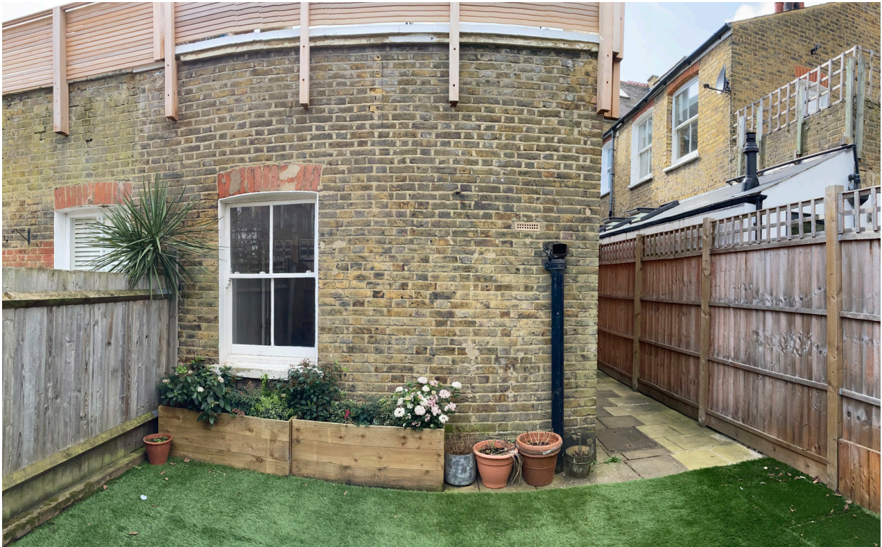
4 - Single storey rear volume facade