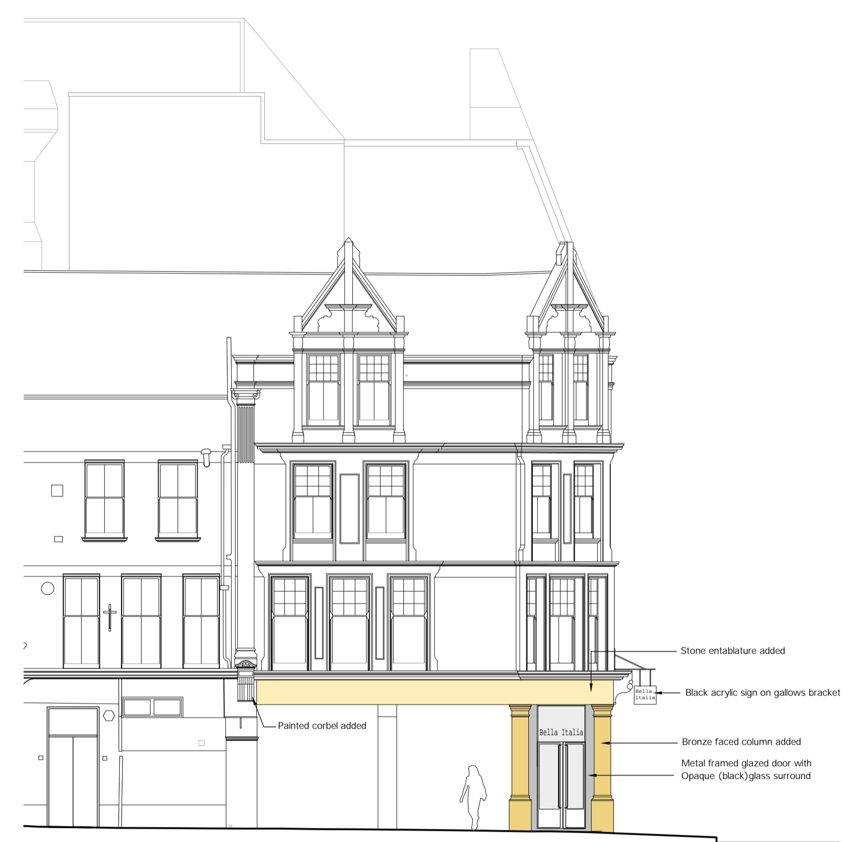
VICTORIA COURT ELEVATION