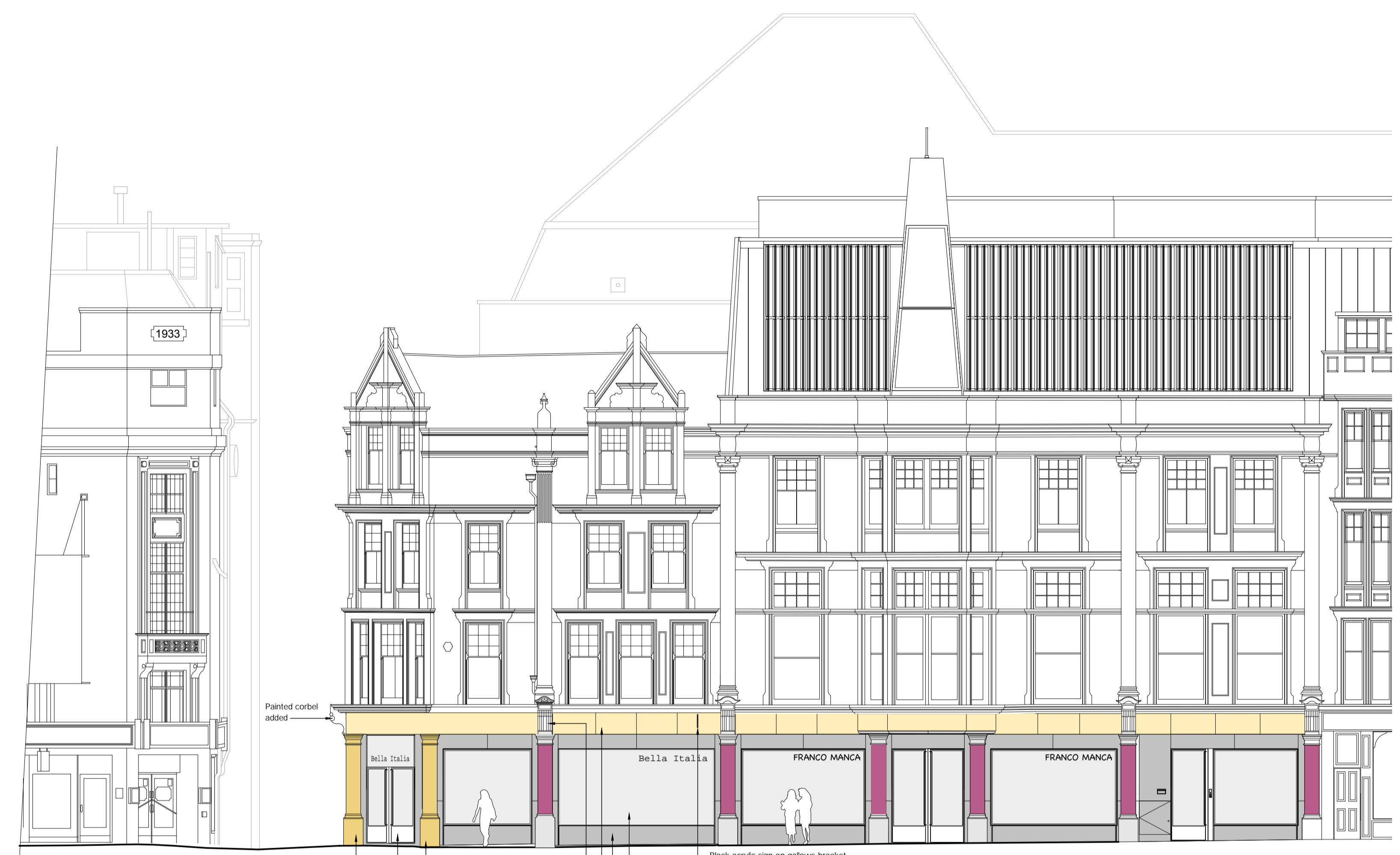
GEORGE STREET ELEVATION 2