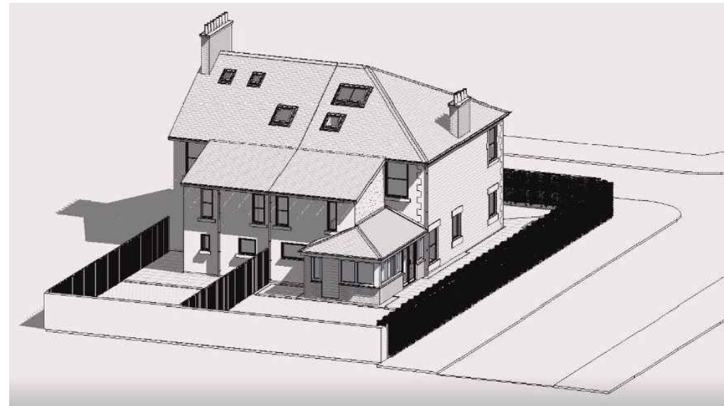
EXISTING - 21st June 14:10