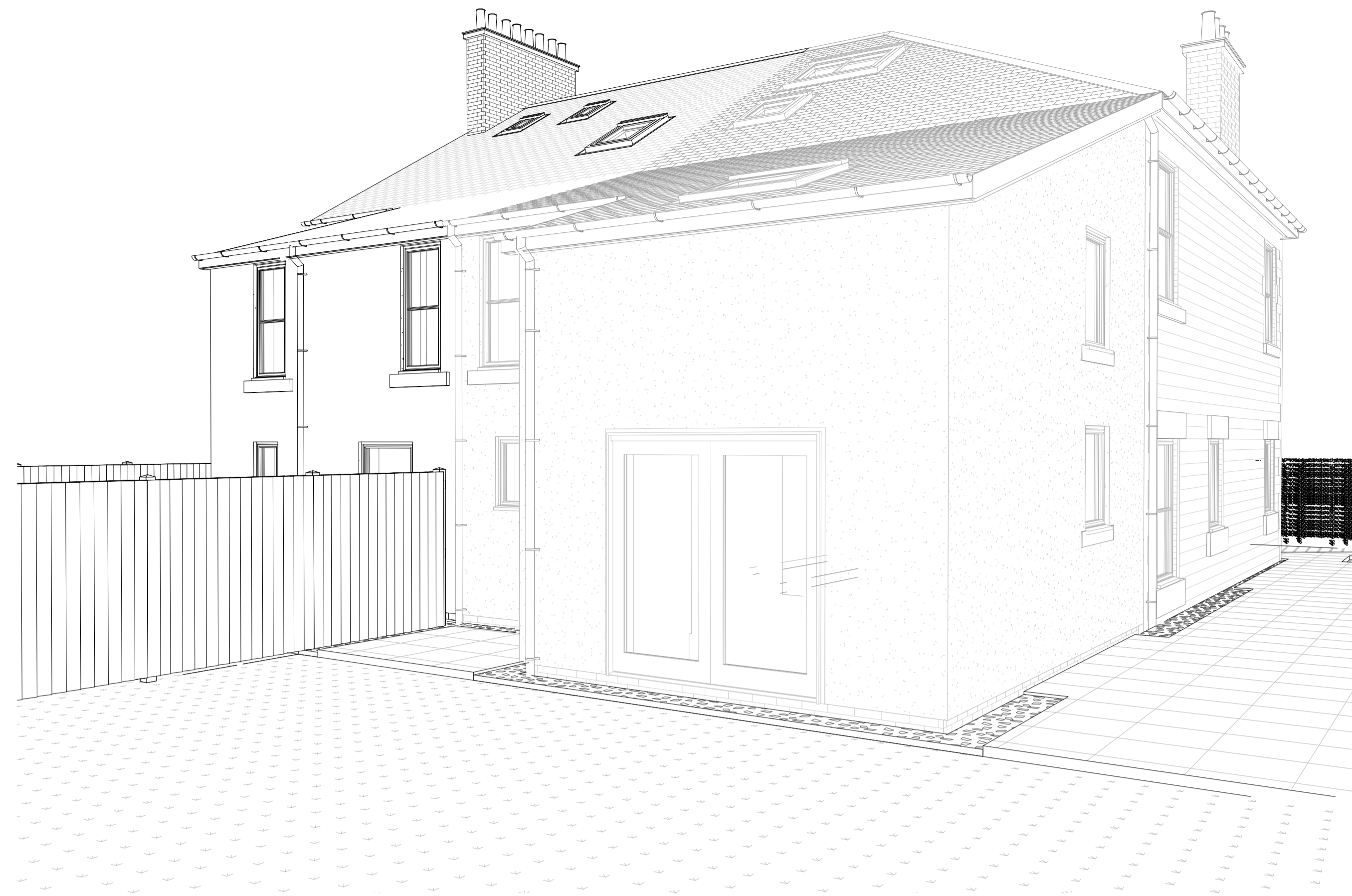
3D View 1