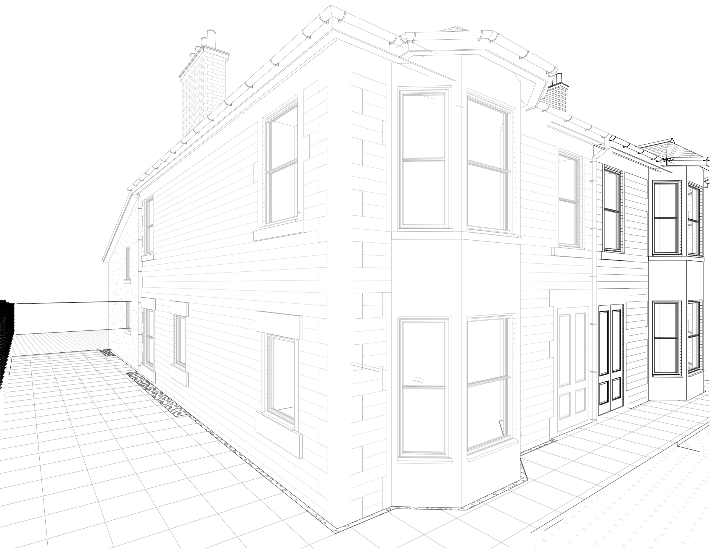
3D View 2