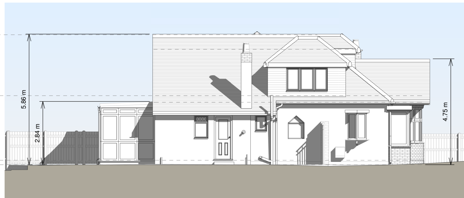
Left Side Elevation