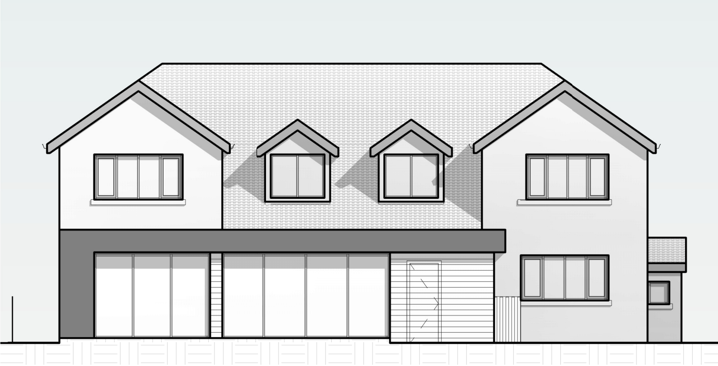
03 Proposed Rear Elevation