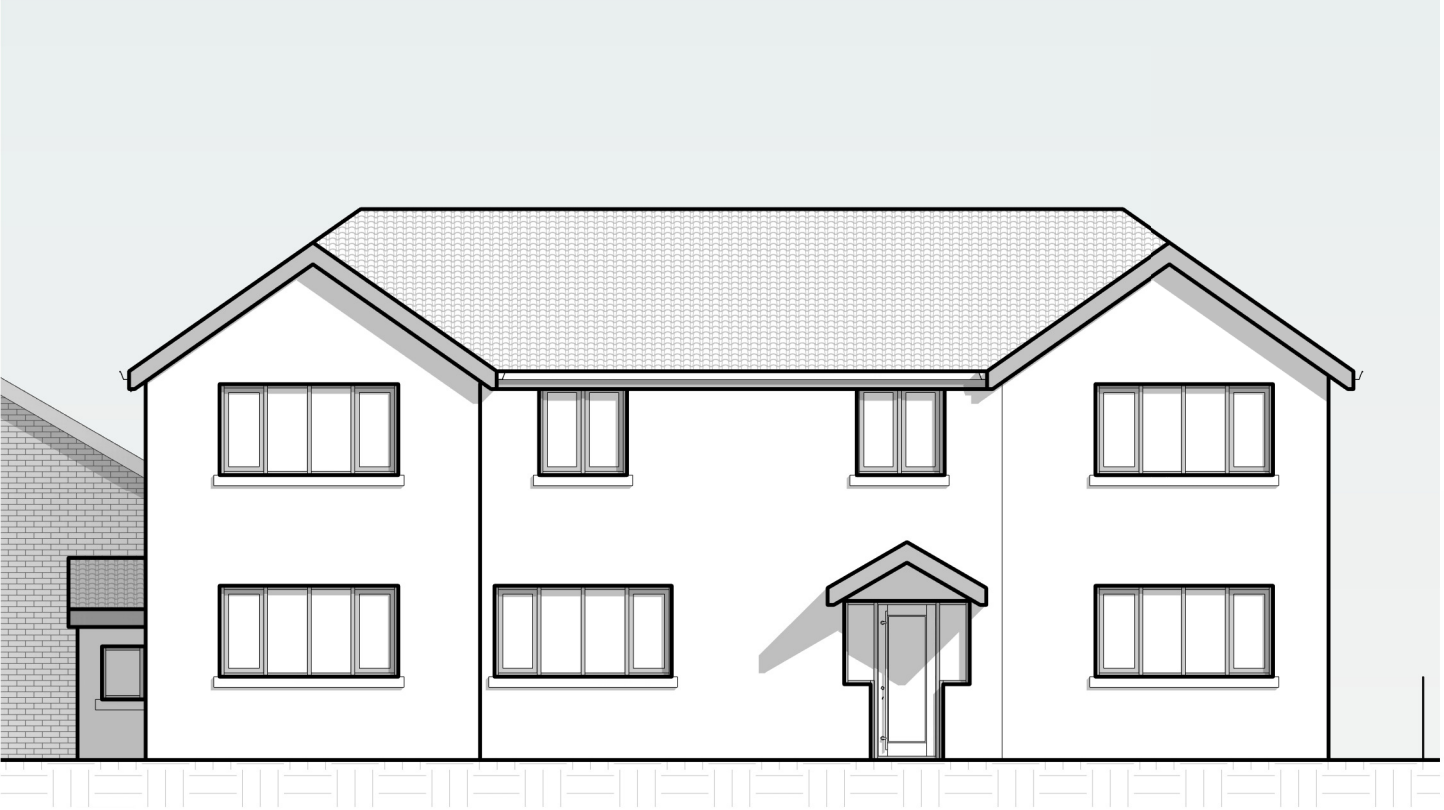
01 Proposed Front Elevation