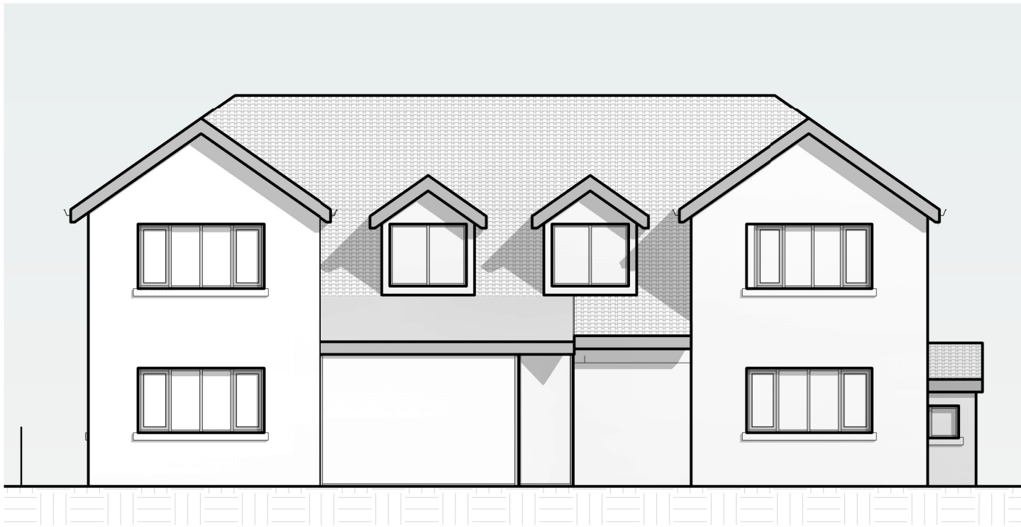
03 Existing Rear Elevation 1 : 100