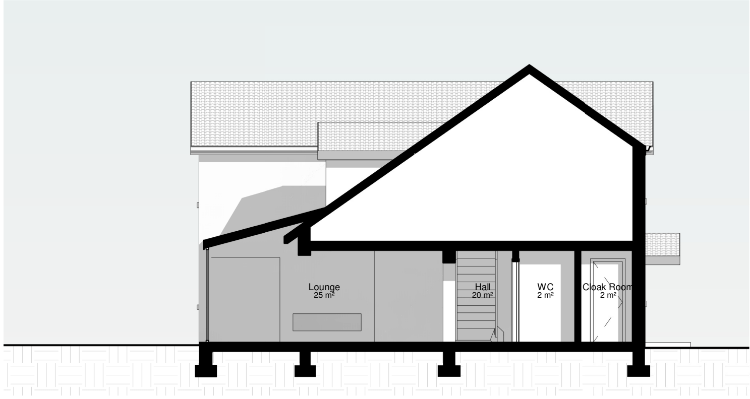
01 Existing Section