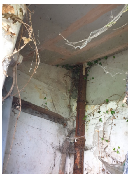
Figure 1 Looking into external wc compartment showing sloping ceiling