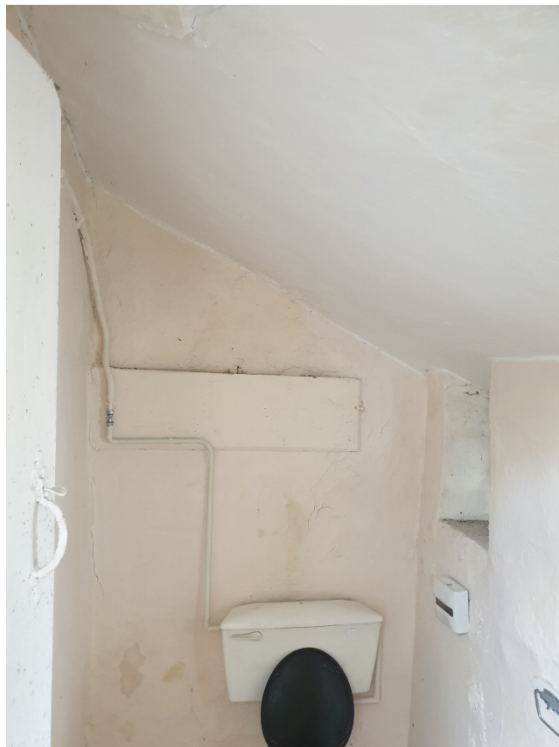
Figure 3 Looking at sloping ceiling to first floor wc compartment