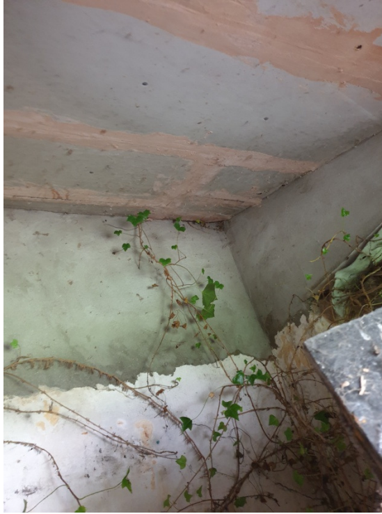
Figure 2 Looking into external wc compartment showing sloping ceiling