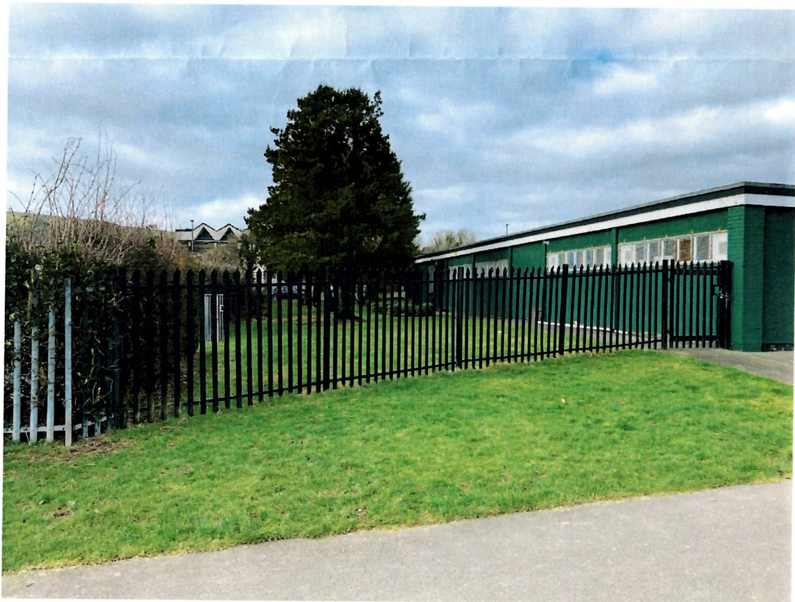
Photograph 1 - 3: The Proposed Site

In response, we propose to site the container as closely as possible to the existing buildings on the site. We want to place it between the bowling green, the existing palisade fence and the existing changing room. The proposed location is clearly illustrated in the photographs below.