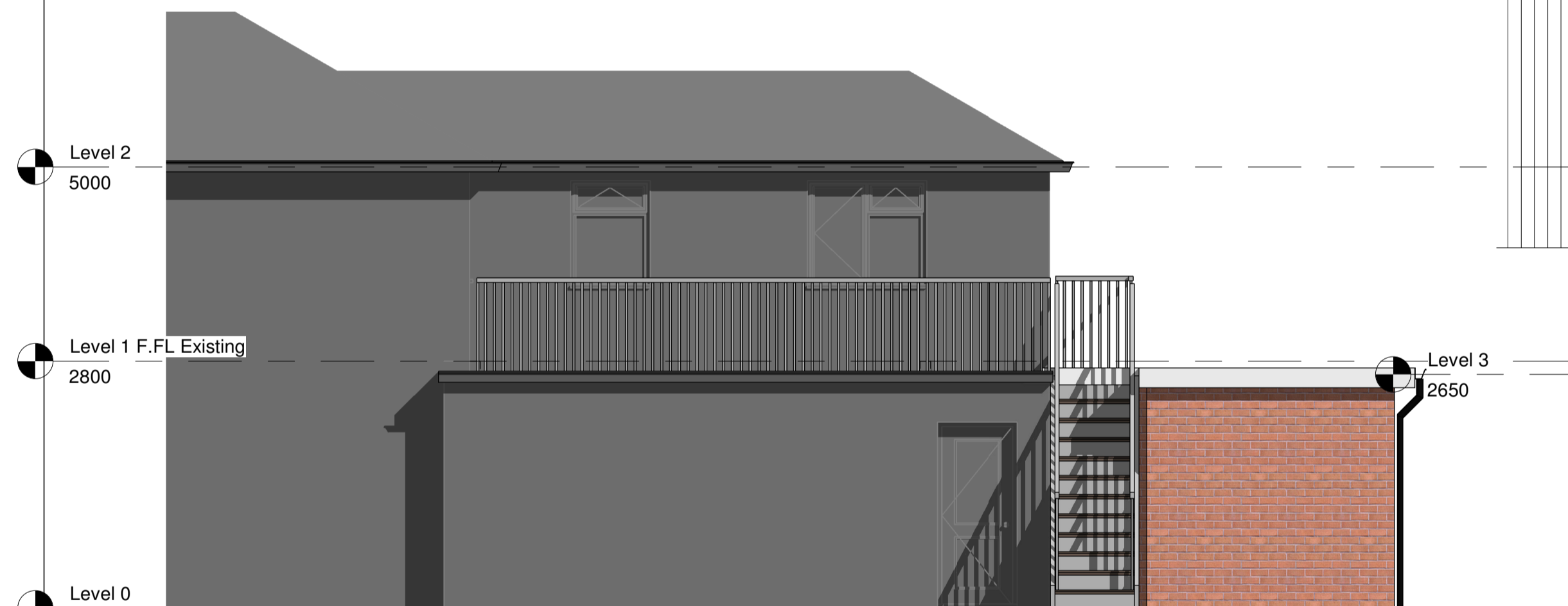
West 1 : 50