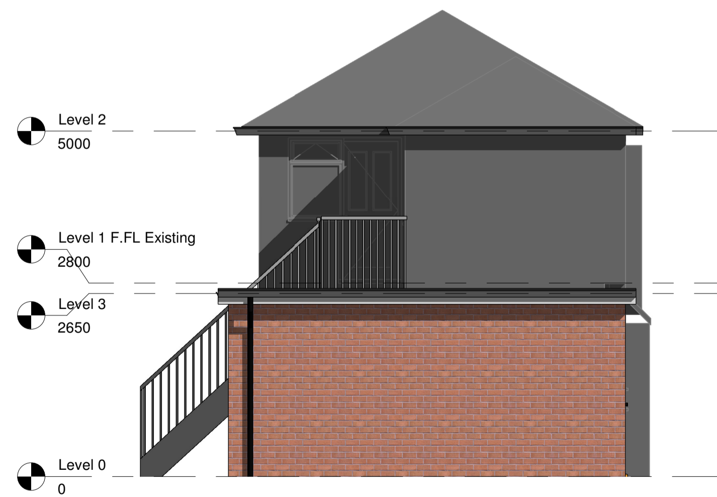
1 South 1 : 50