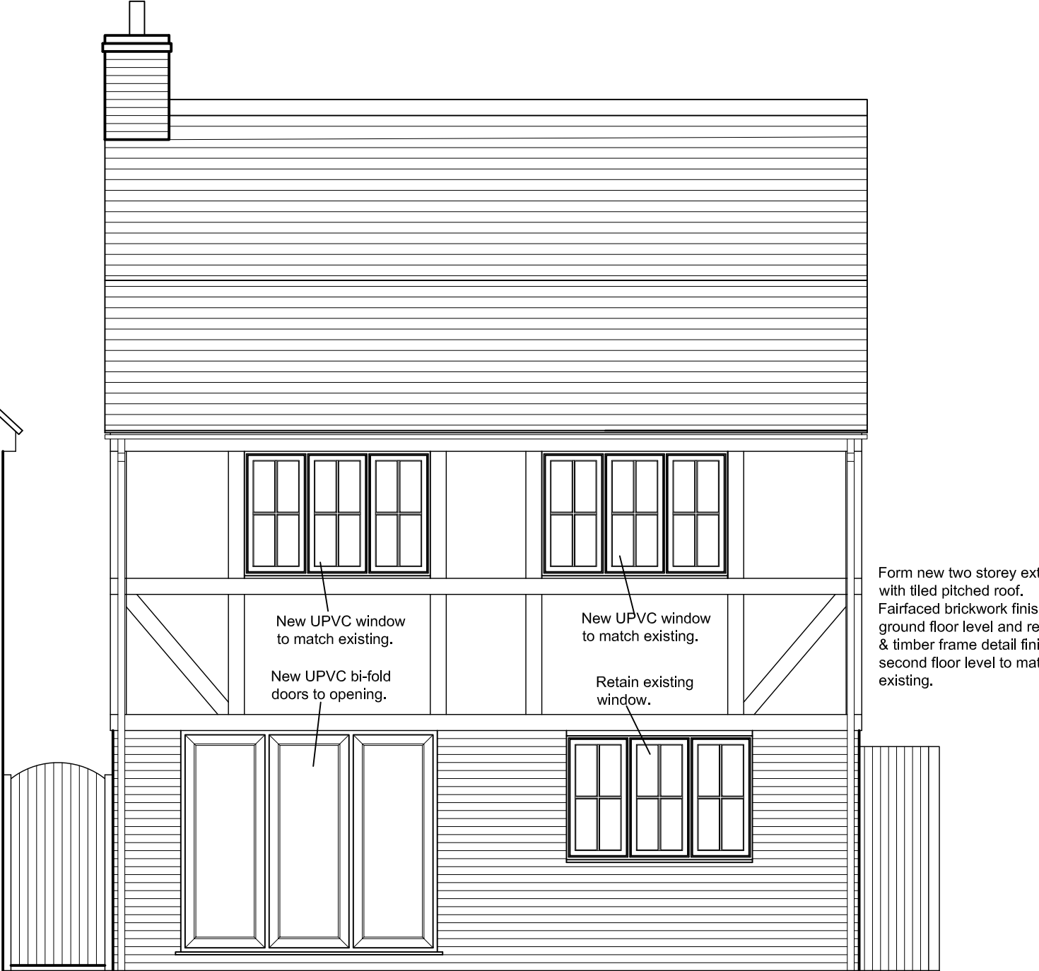
Proposed North West Elevation