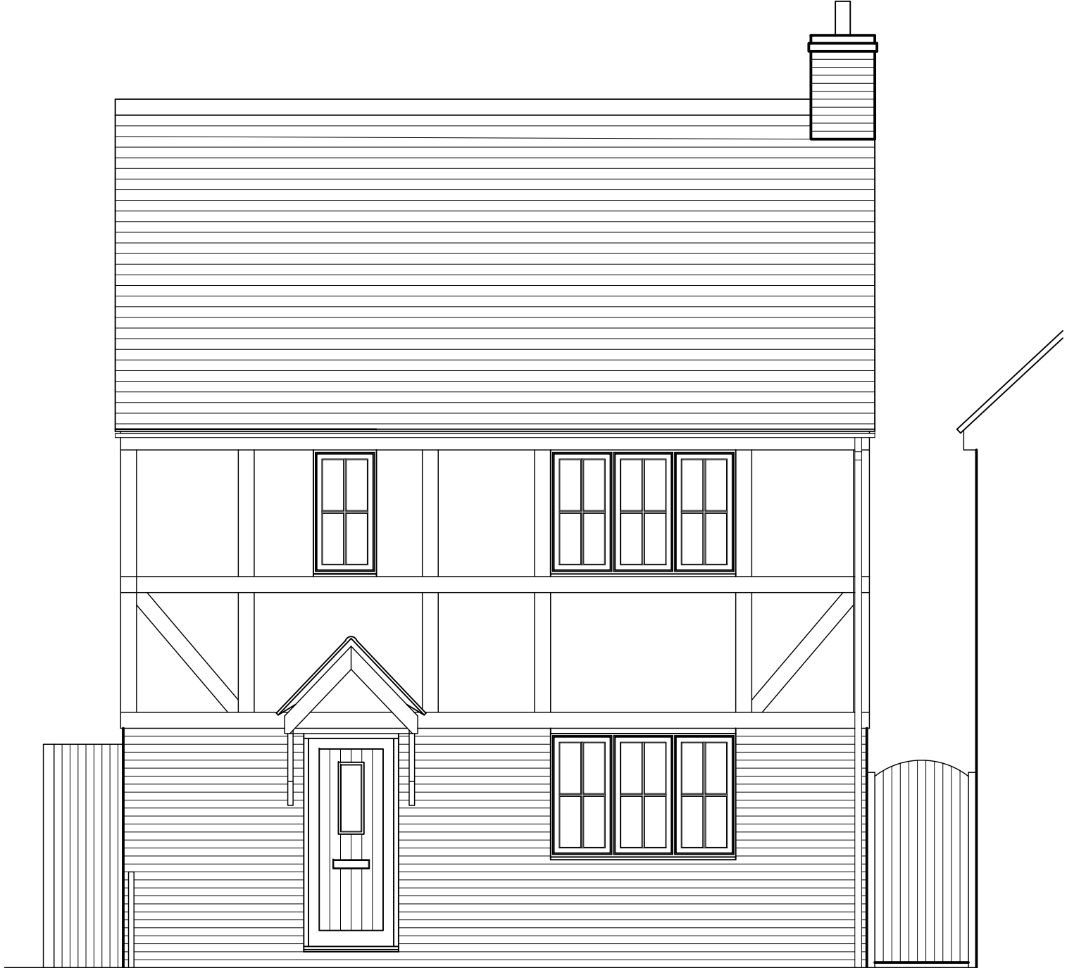
Proposed South East Elevation