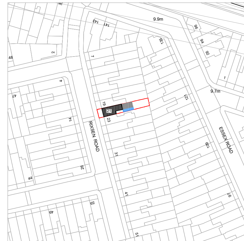
Site Plan - Scale: 1:1250