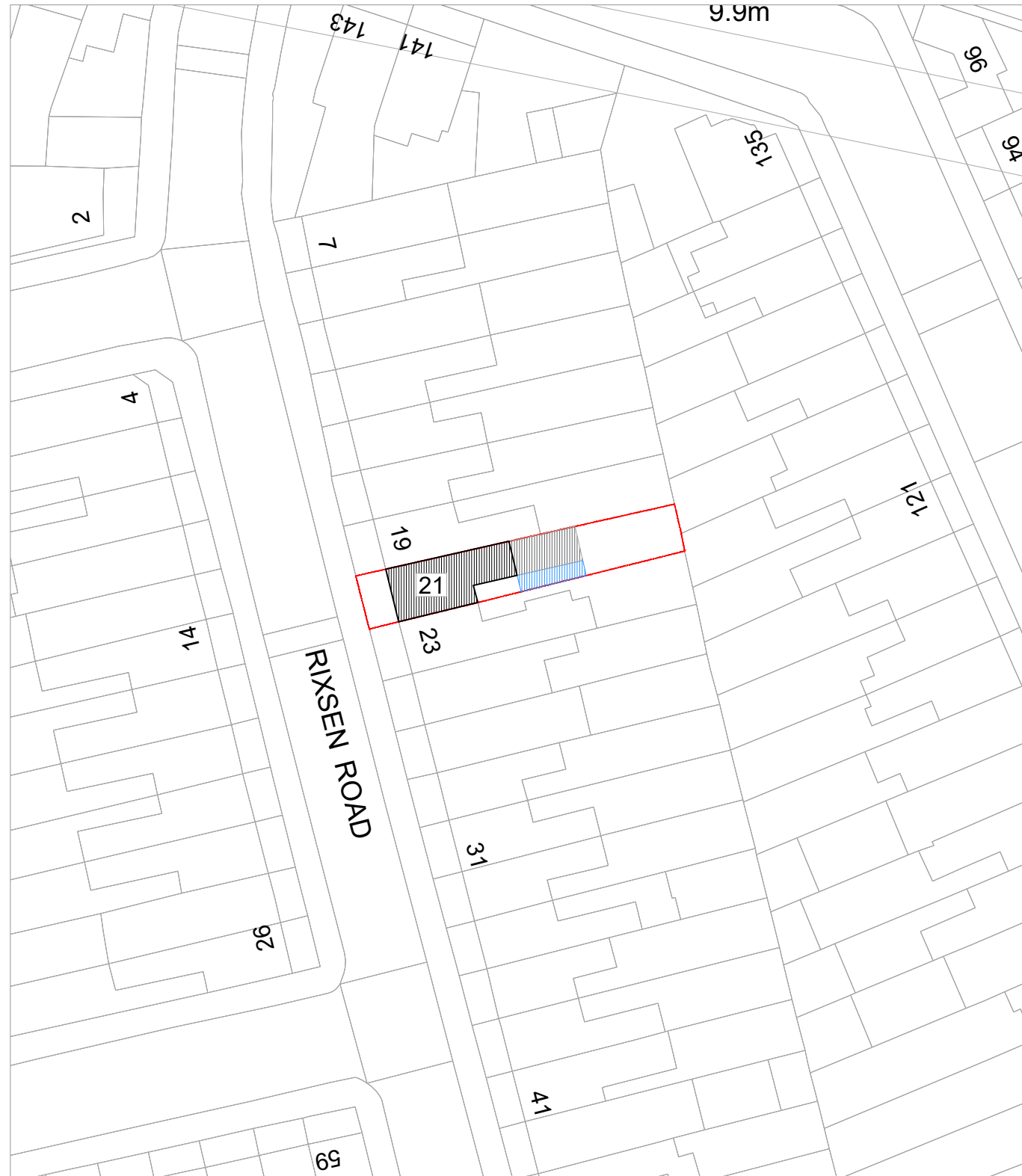
Block Plan - Scale: 1:500