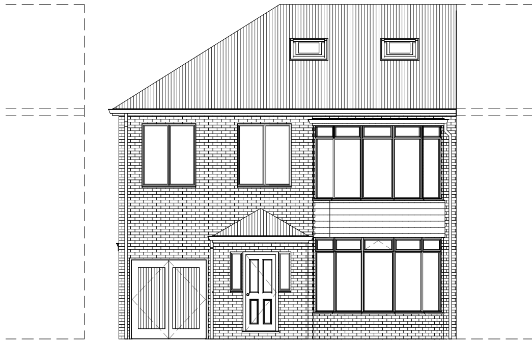
1 Front Elevation 1 : 100