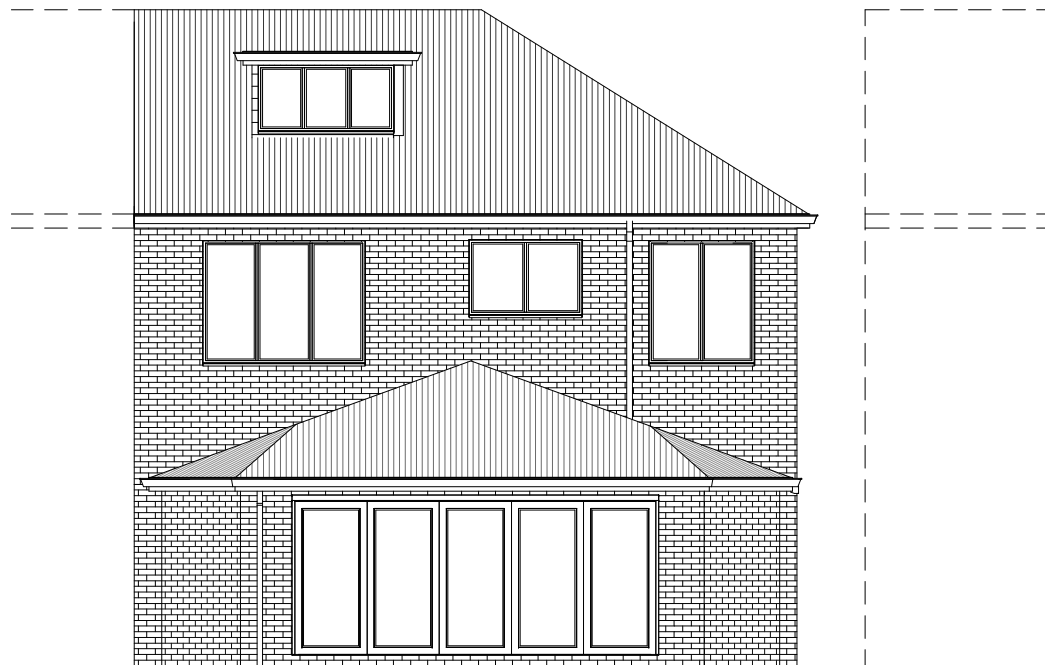
3 Rear Elevation 1 : 100