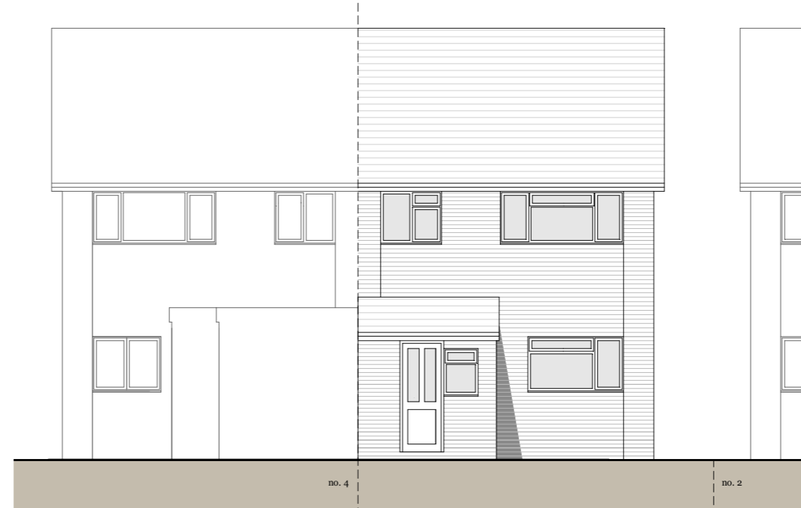
01. Front Elevation behind garage (North West)