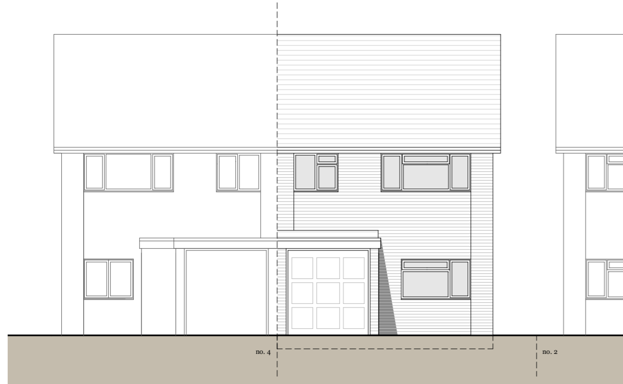
01. Front Elevation from street (North West)

Existing materials: Wall: Buff and red facing brick Roof: Concrete tiles Garage roof: Felt Doors and Windows: UPVC frames - white