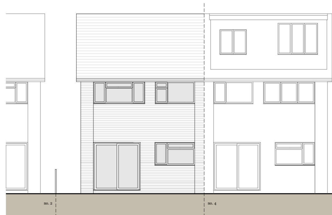
04. Rear Elevation (South East)