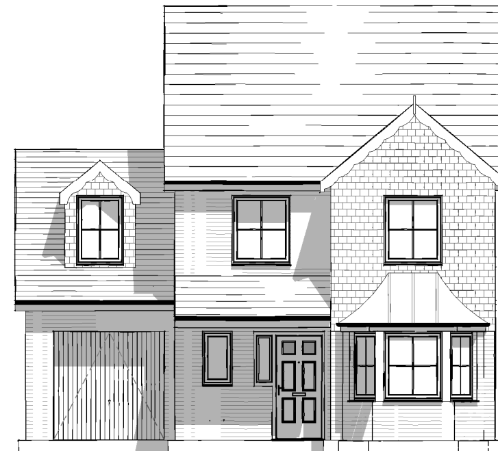
Front Elevation. 1 : 100