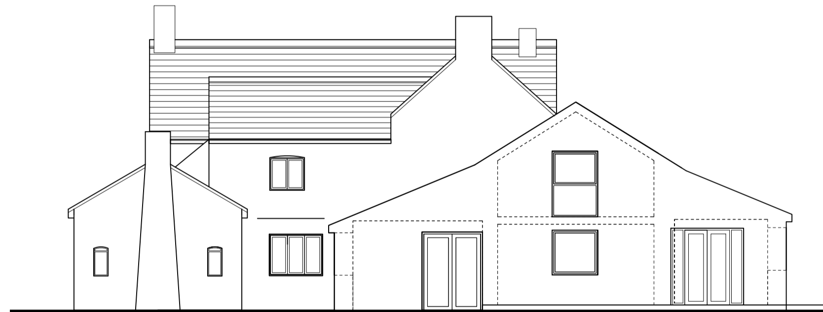
North West elevation as existing 1:100 scale