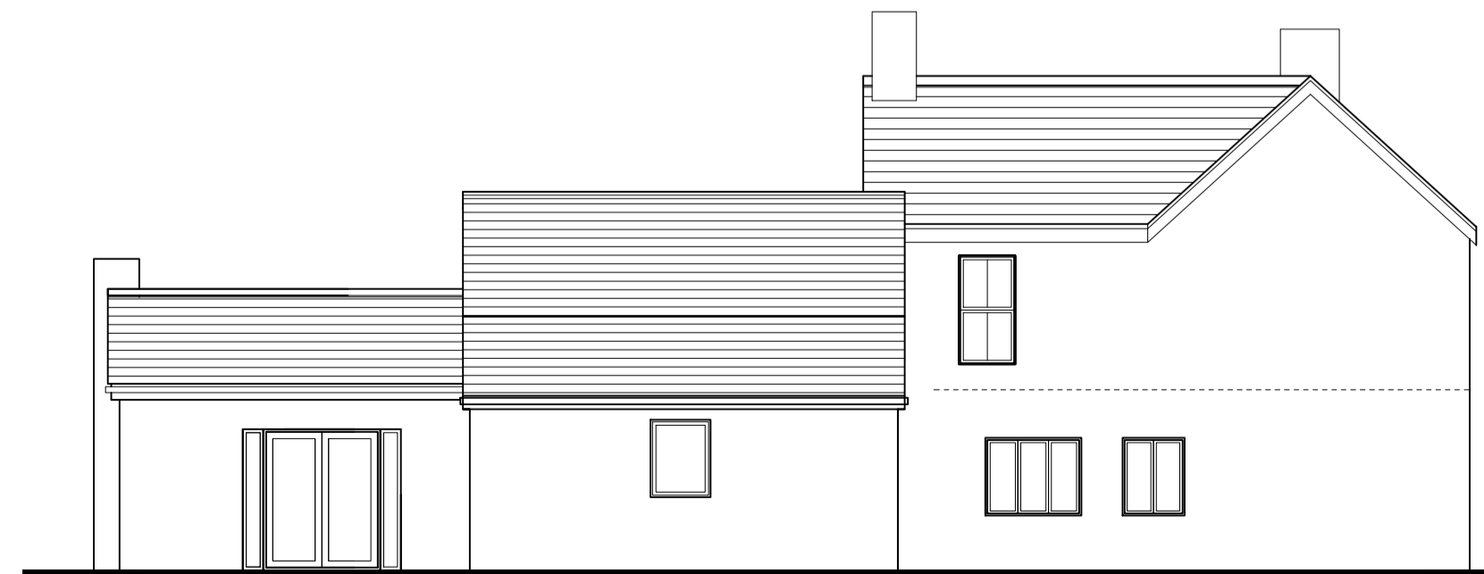
South West elevation as existing 1:100 scale