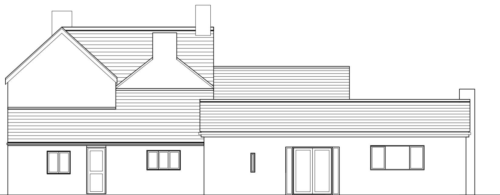
North East elevation as existing 1:100 scale