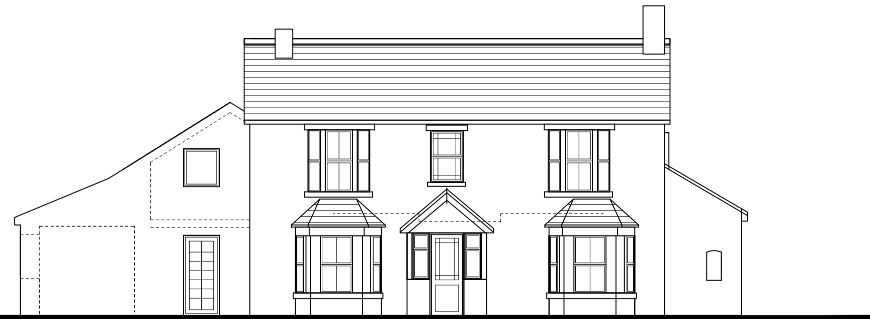
South East elevation as existing 1:100 scale