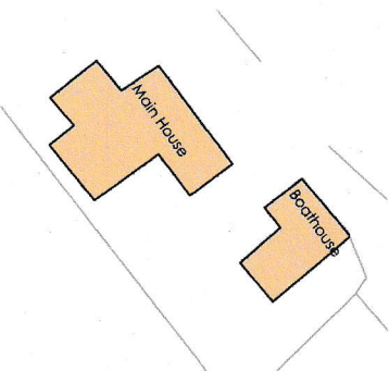
Block Plan (existing) (scale 1:500)