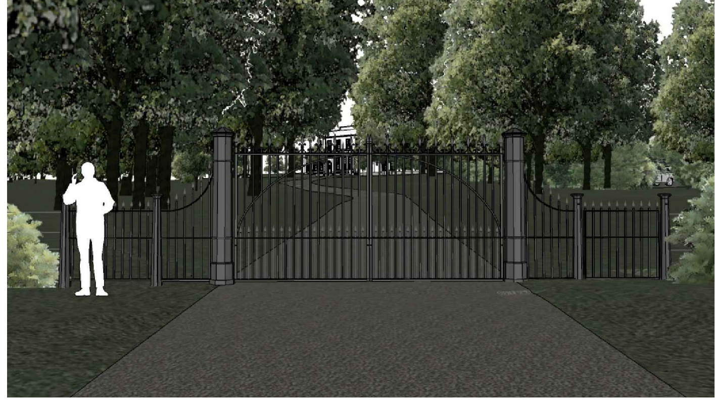
Drive Way Gate 3D model Not to scale