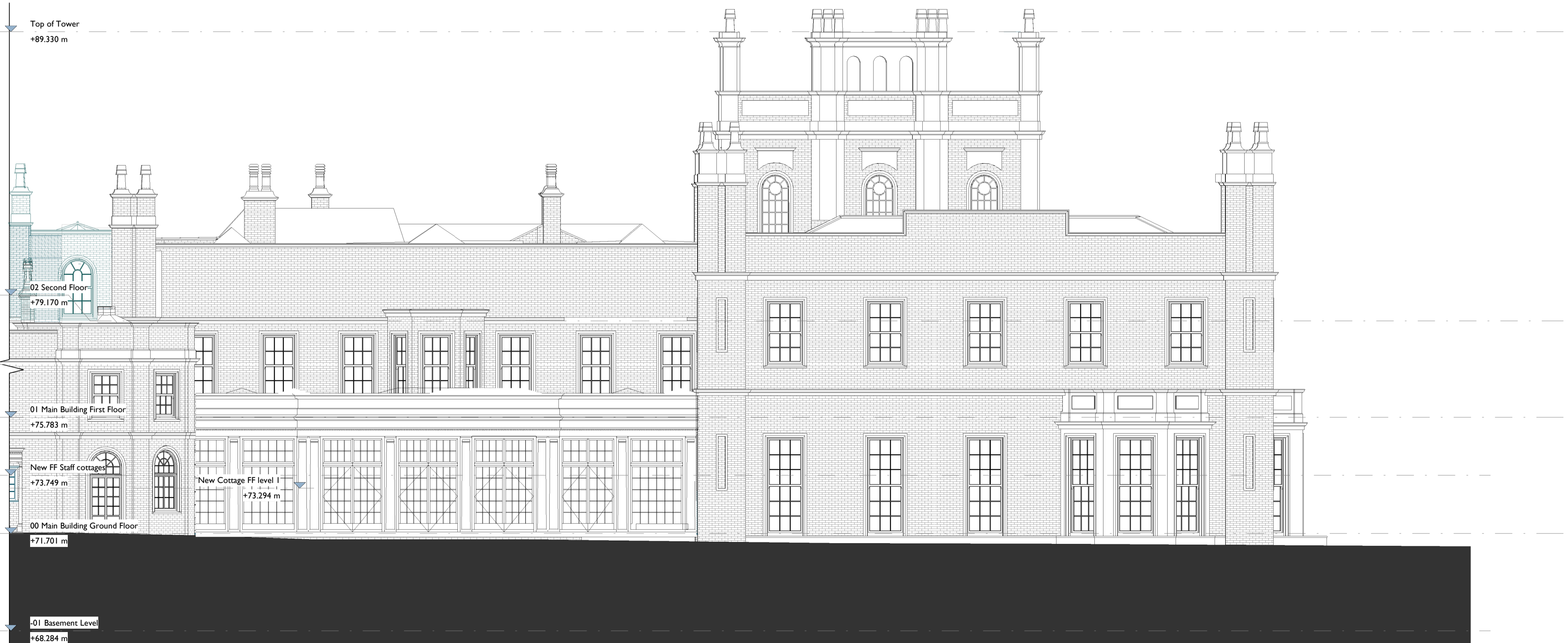
2 1717 House Elevation 2 (HE2) Proposed 2 2104 1 : 100