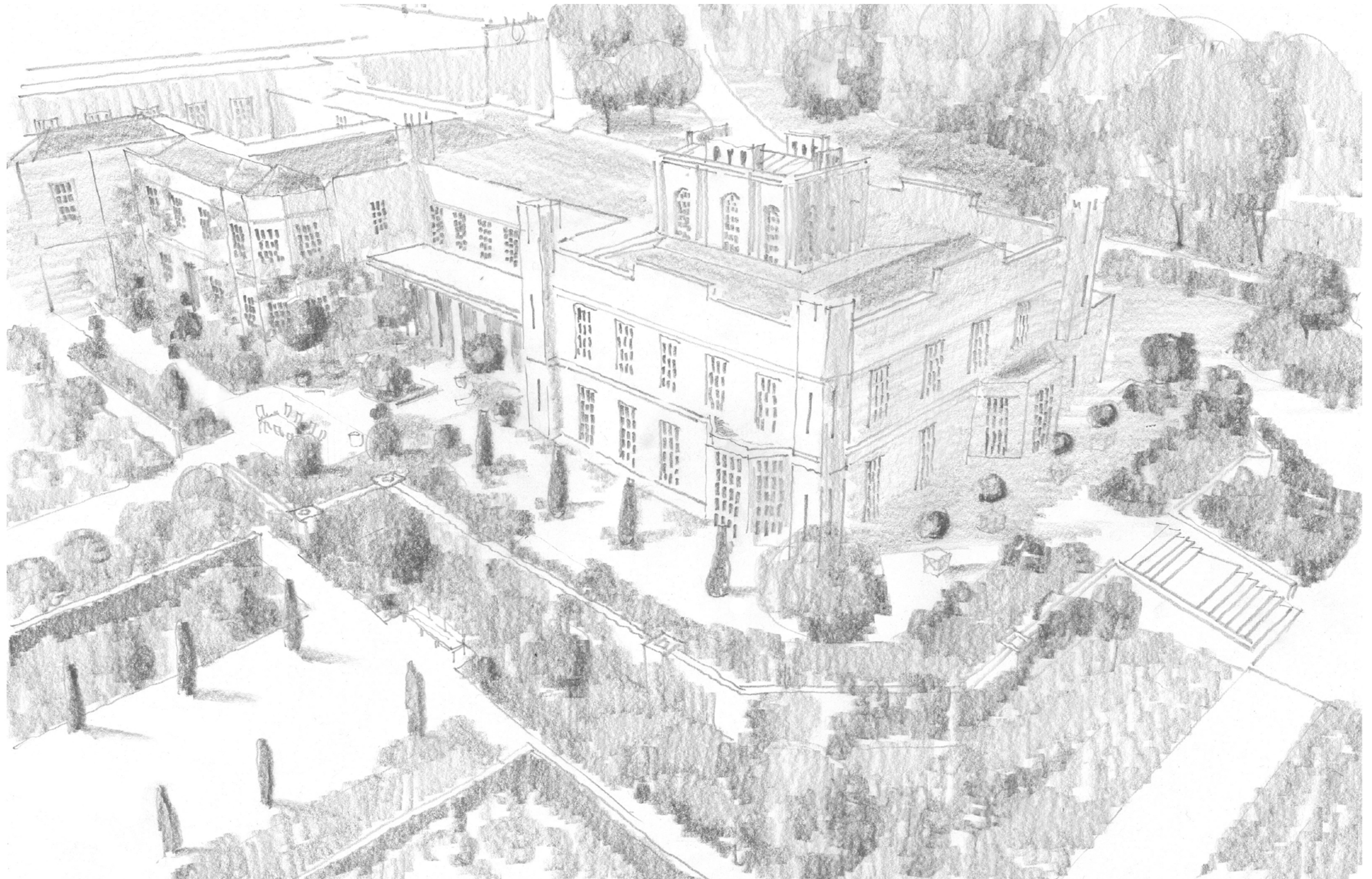
Concept sketch proposal Reinstatement of formal terrace arrangement and herbaceous borders.