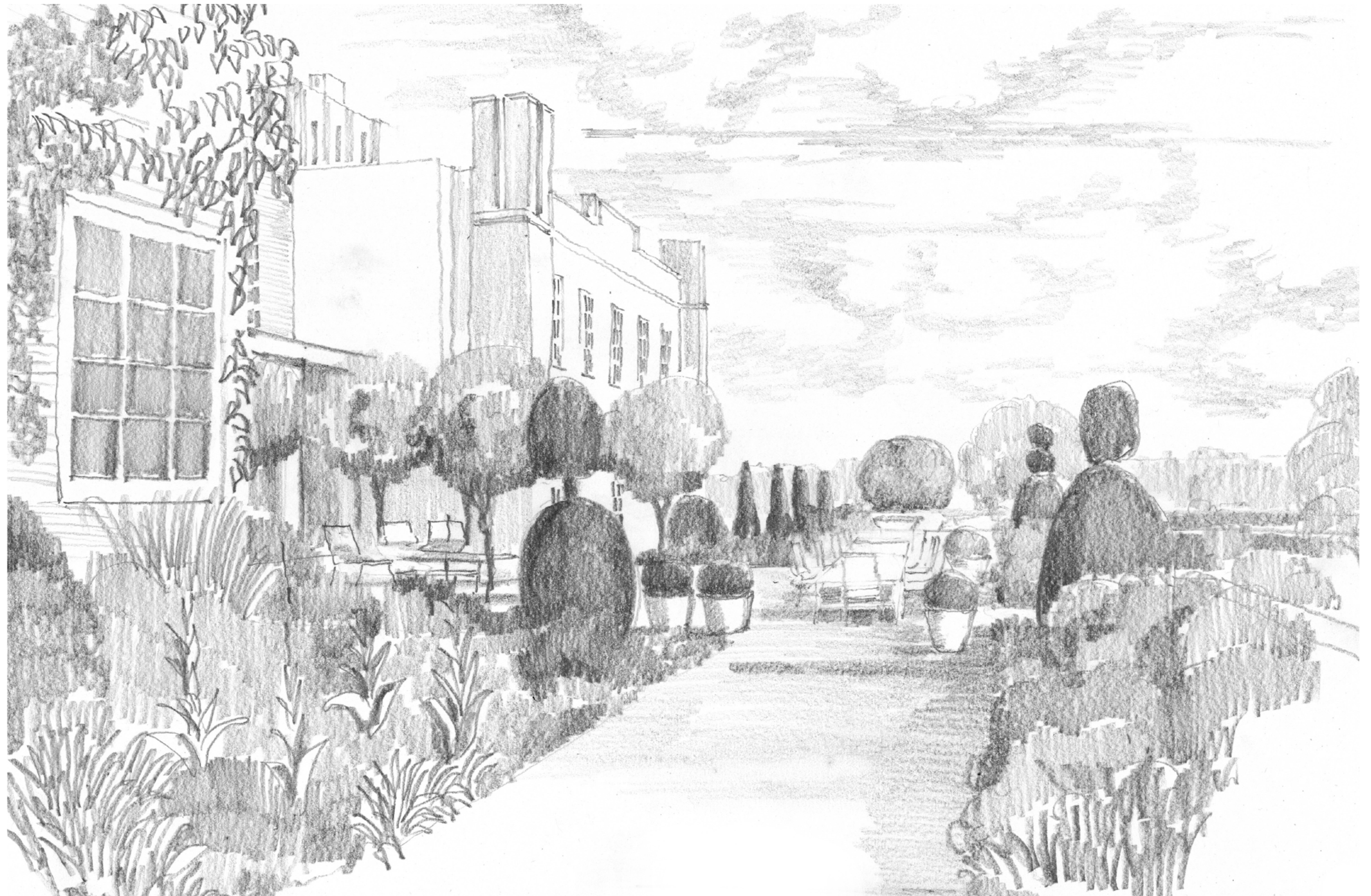
Initial concept sketch proposal showing view of the family terrace.