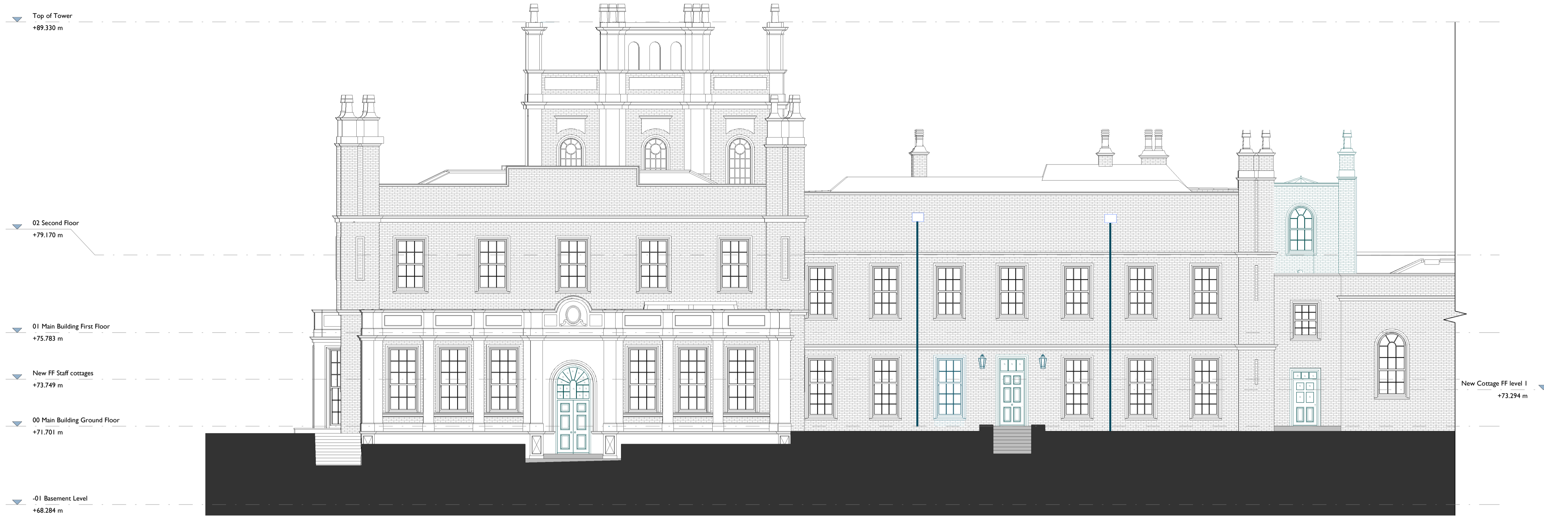
1 1717 House Elevation I (HE1) Proposed 2103 1 : 100

Notes: Drawings are based on survey data and may not accurately represent what is physically present. Do not scale from this drawing. All dimensions are to be verified on site before proceeding with the work. All dimensions are in millimeters unless noted otherwise. Purcell shall be notified in writing of any discrepancies.