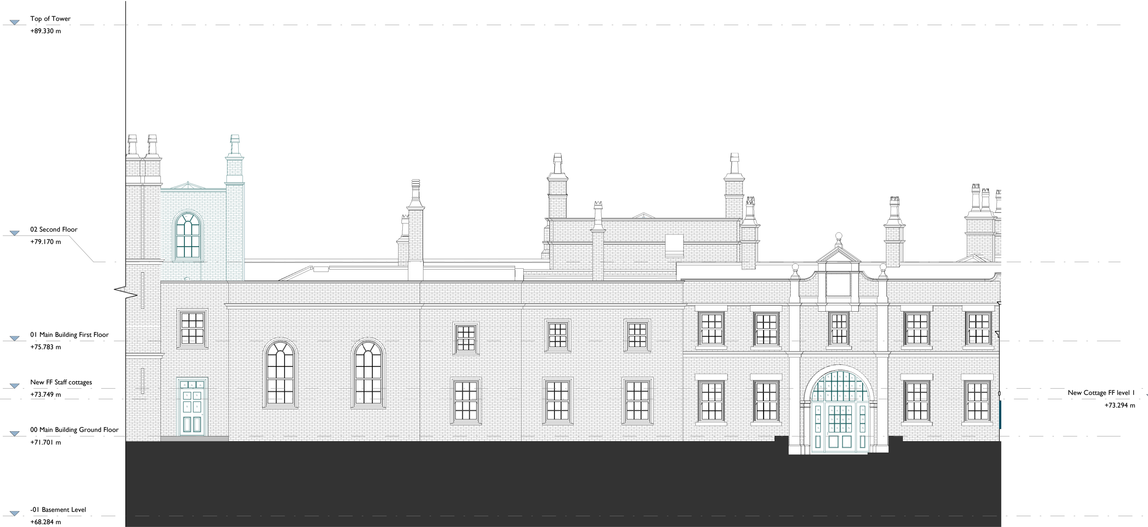
2 1717 House Elevation I (HE1) Proposed 2 2103 1 : 100