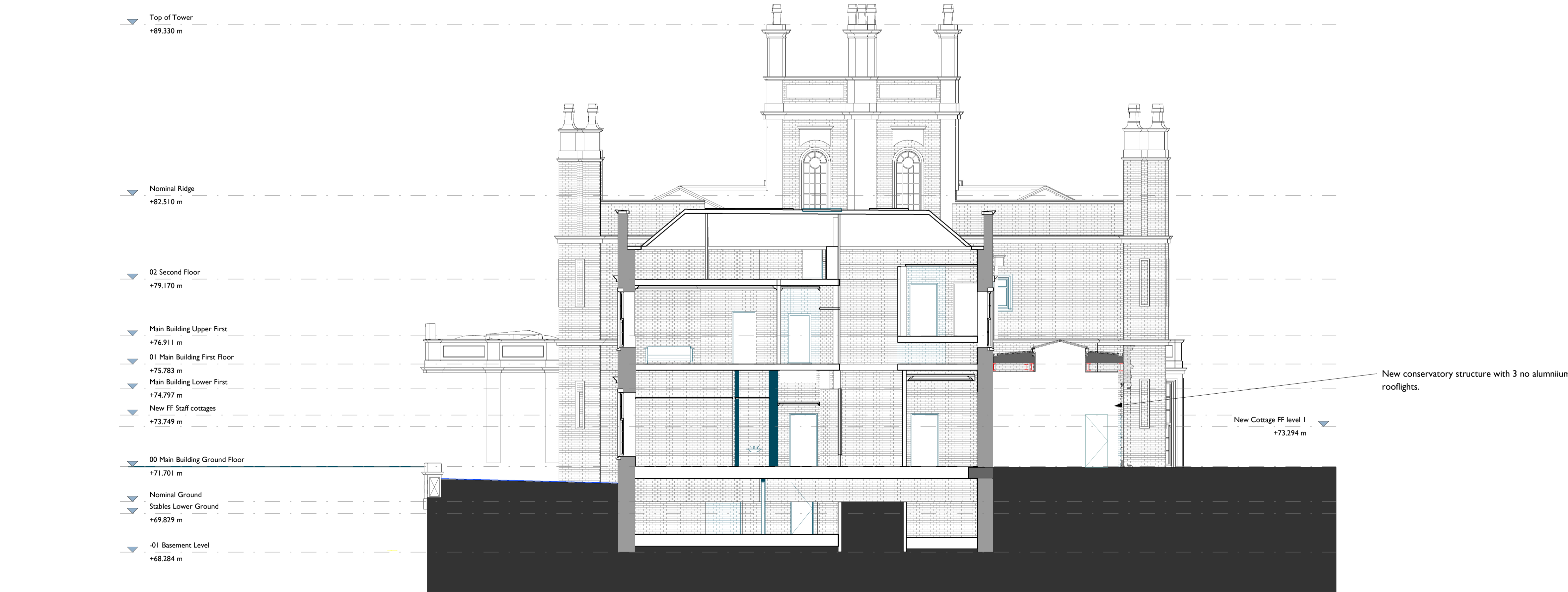
2 Wyatt Wing Elevation 2 (WE2) Proposed 2106 1:100