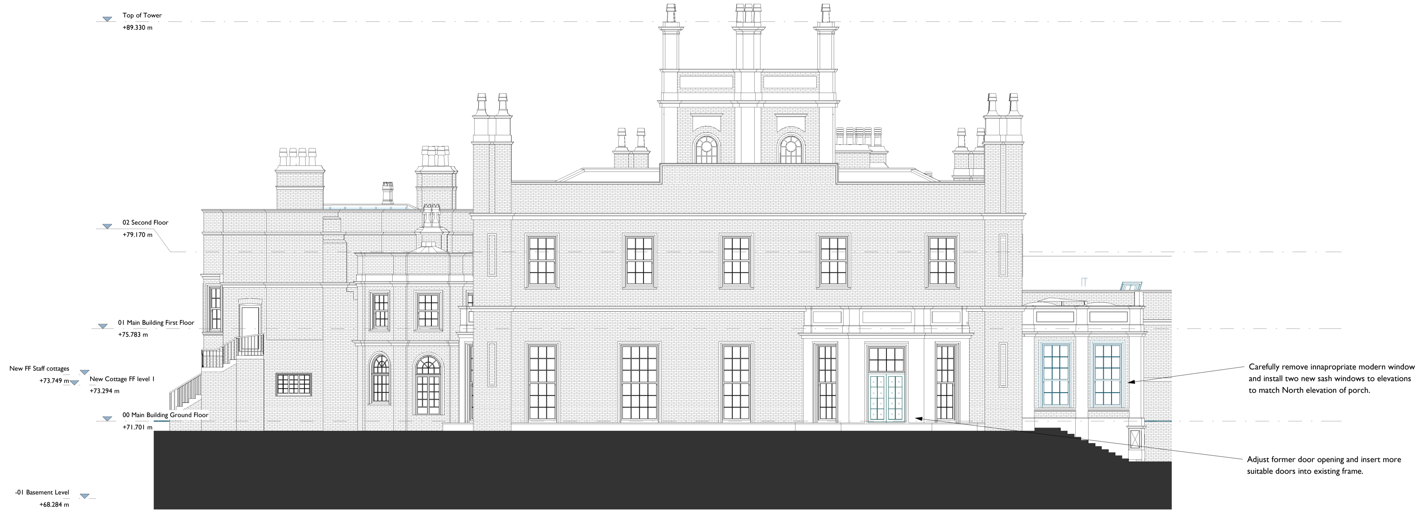
1 Wyatt Wing Elevation 1 (WE1) Proposed 2106 1:100