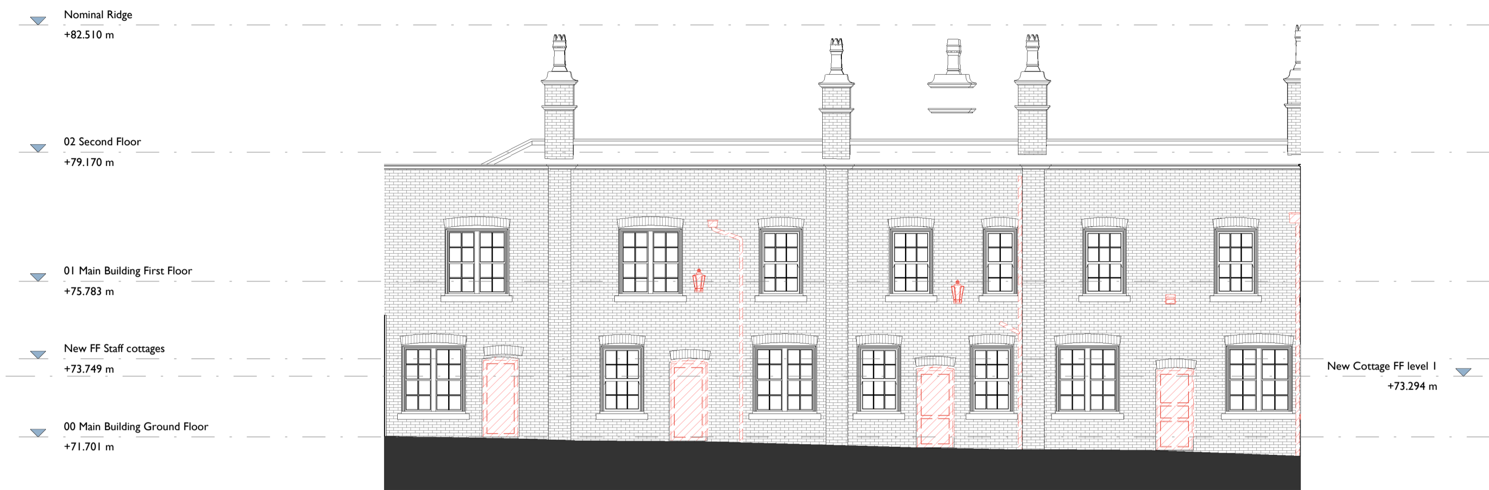
1 Office Wing Elevation 1 (OE1) as Existing Demolition 1015 1 : 100