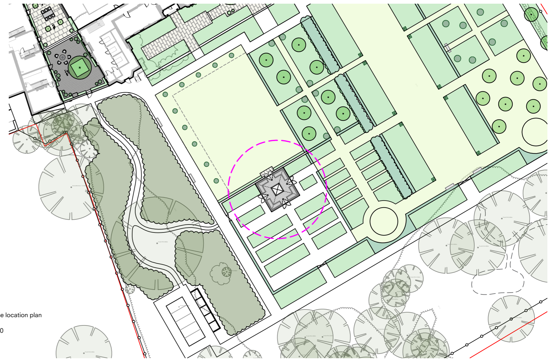
Glasshouse location plan Plan Scale 1:500