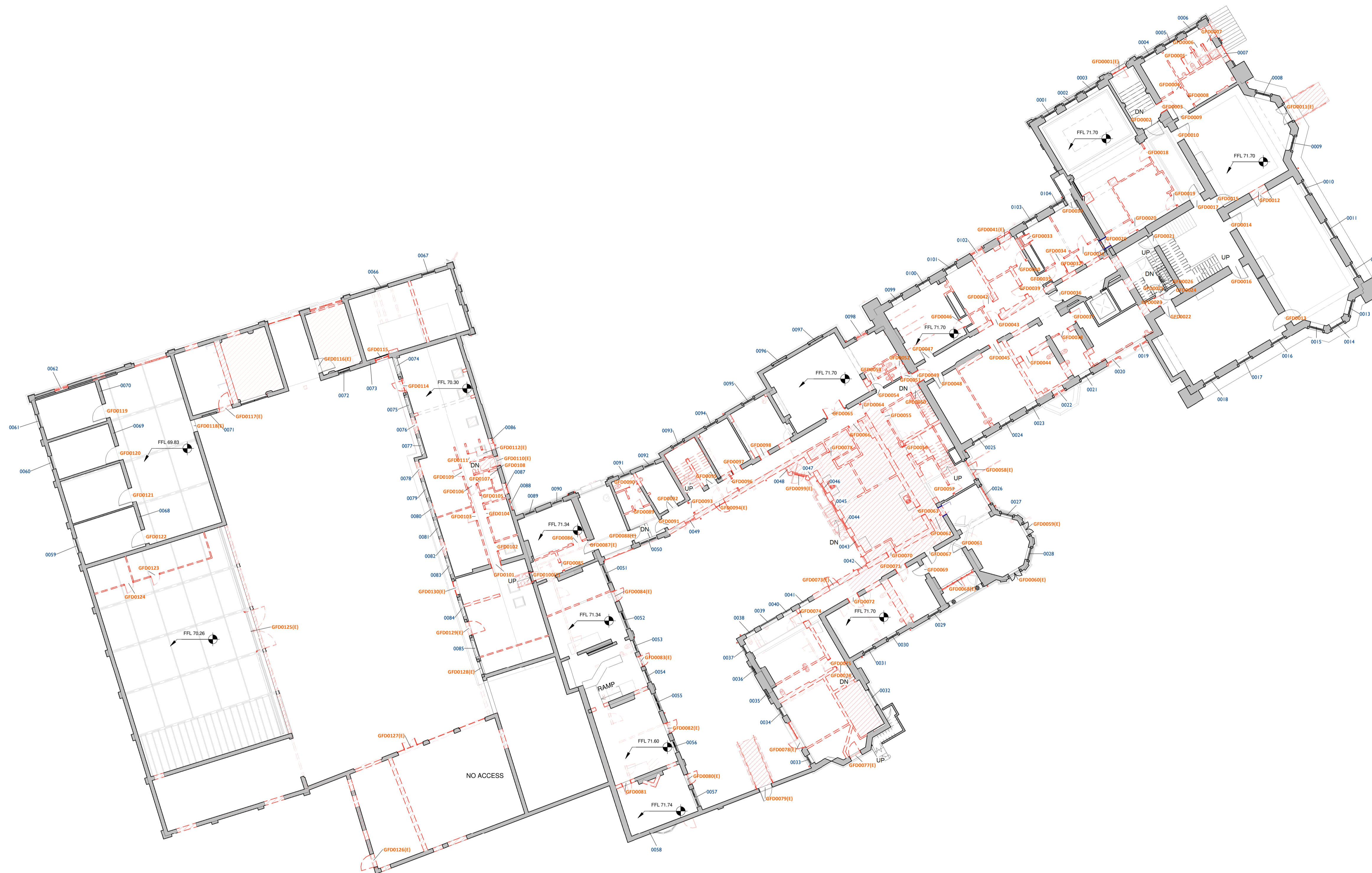
I Existing Ground Floor Plan 1003 1:200