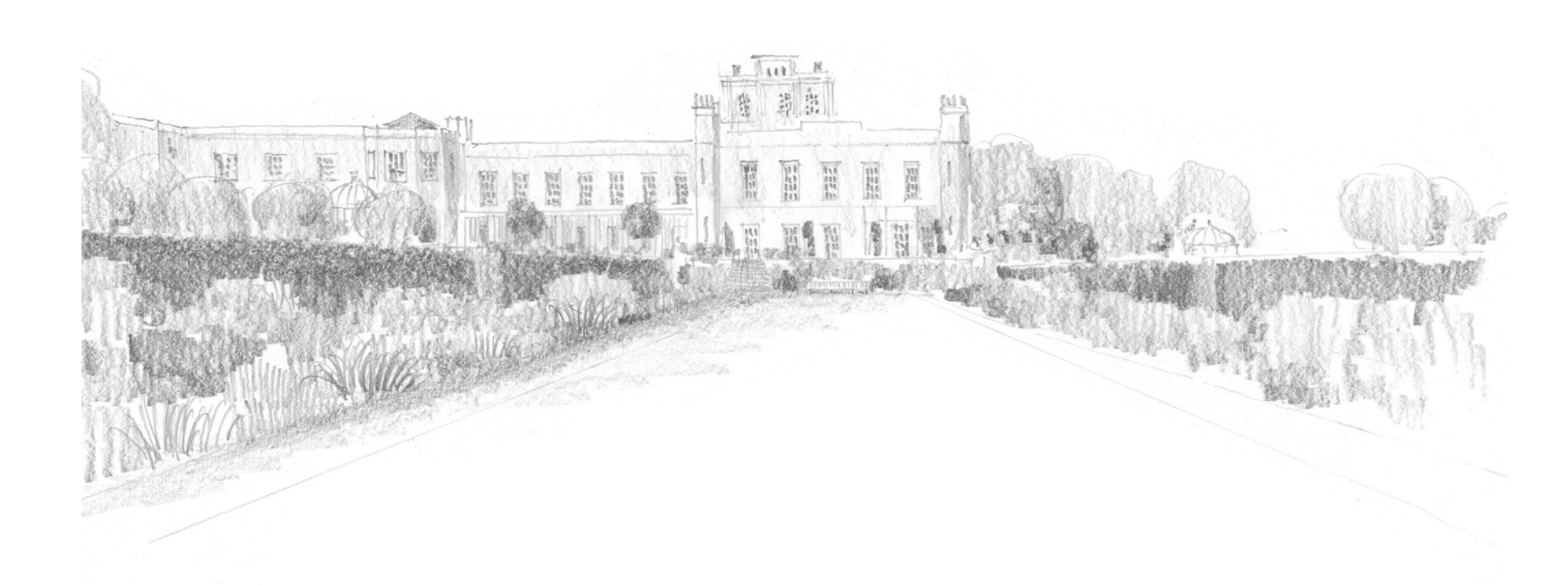
Concept sketch of view from bottom of long border facing the Hall

The south lawn is to become a new formally structured garden. This echoes a pattern made in many great landscape compositions from the early 19th century onwards. An example would be at Newby Hall, Yorkshire, where first a Victorian terrace and then, in the 1920s, a long formal double border was made through what was previously an informal pleasure ground. We suggest a broad framed lawn leading to a central ornate metal gate into the woodland beyond.