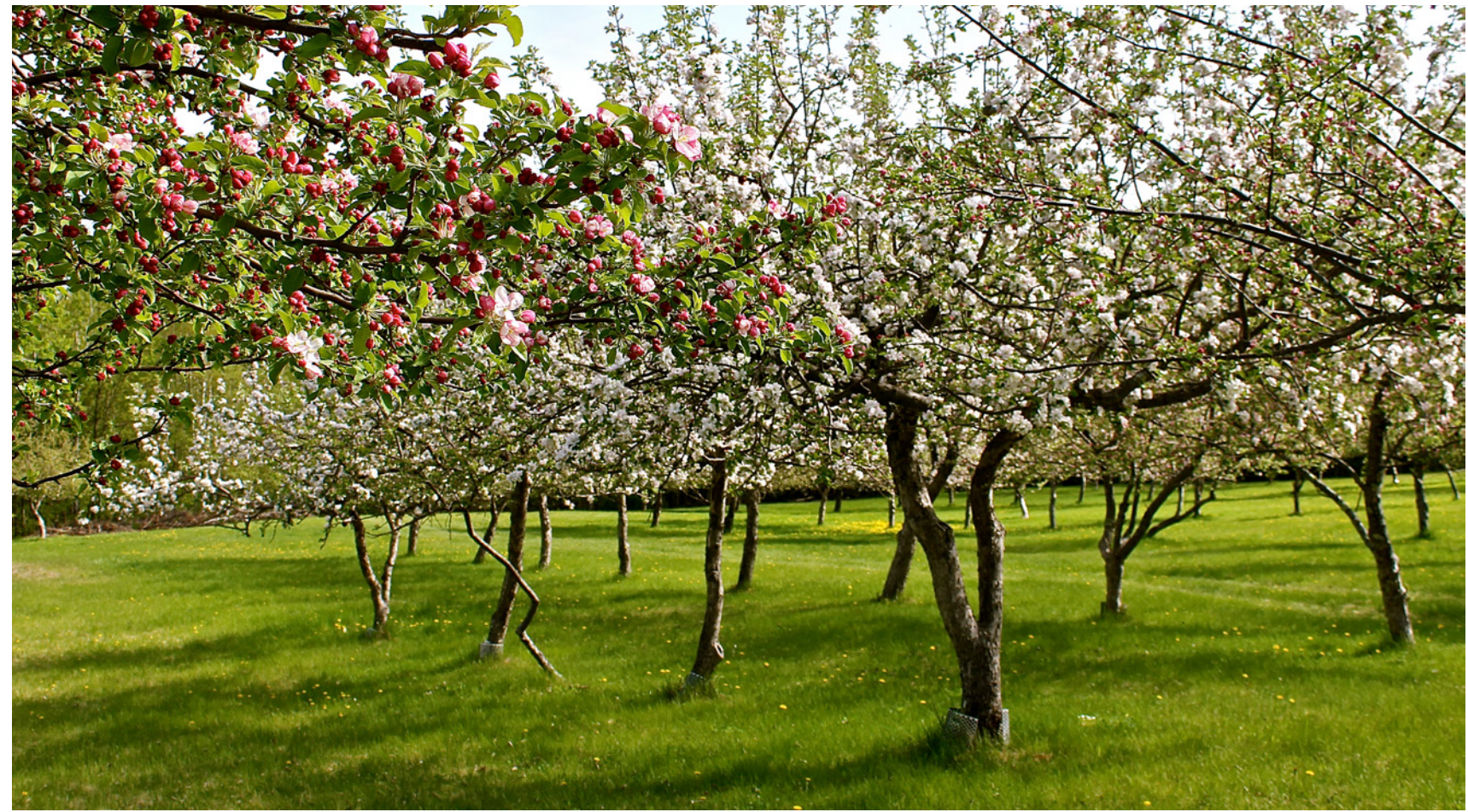
Example of orchard - TSS project

A modest collection of heritage fruit trees are arranged at the end of the central axis of the rose and topiary garden. The trees shall be specially selected to suit the local climate of the site and shall provide both an aesthetic and productive value, in their blossoms and fruits, to the Hall.