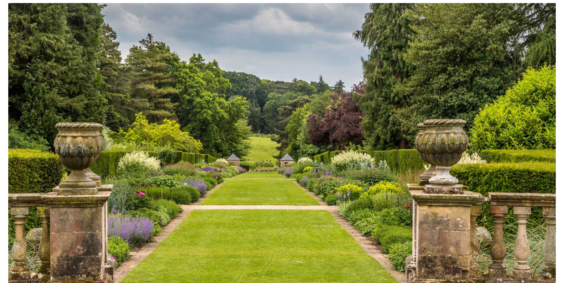
Reference image - Long border, Newby Hall