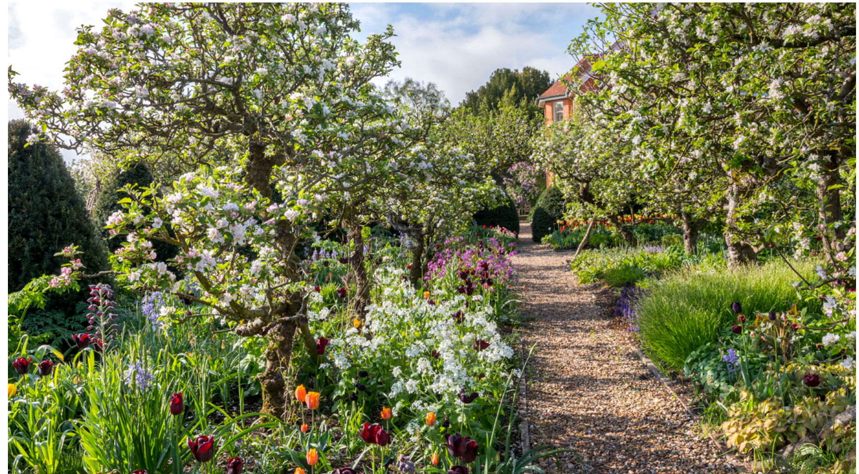
Example of fruit trees with bulb underplanting - TSS project