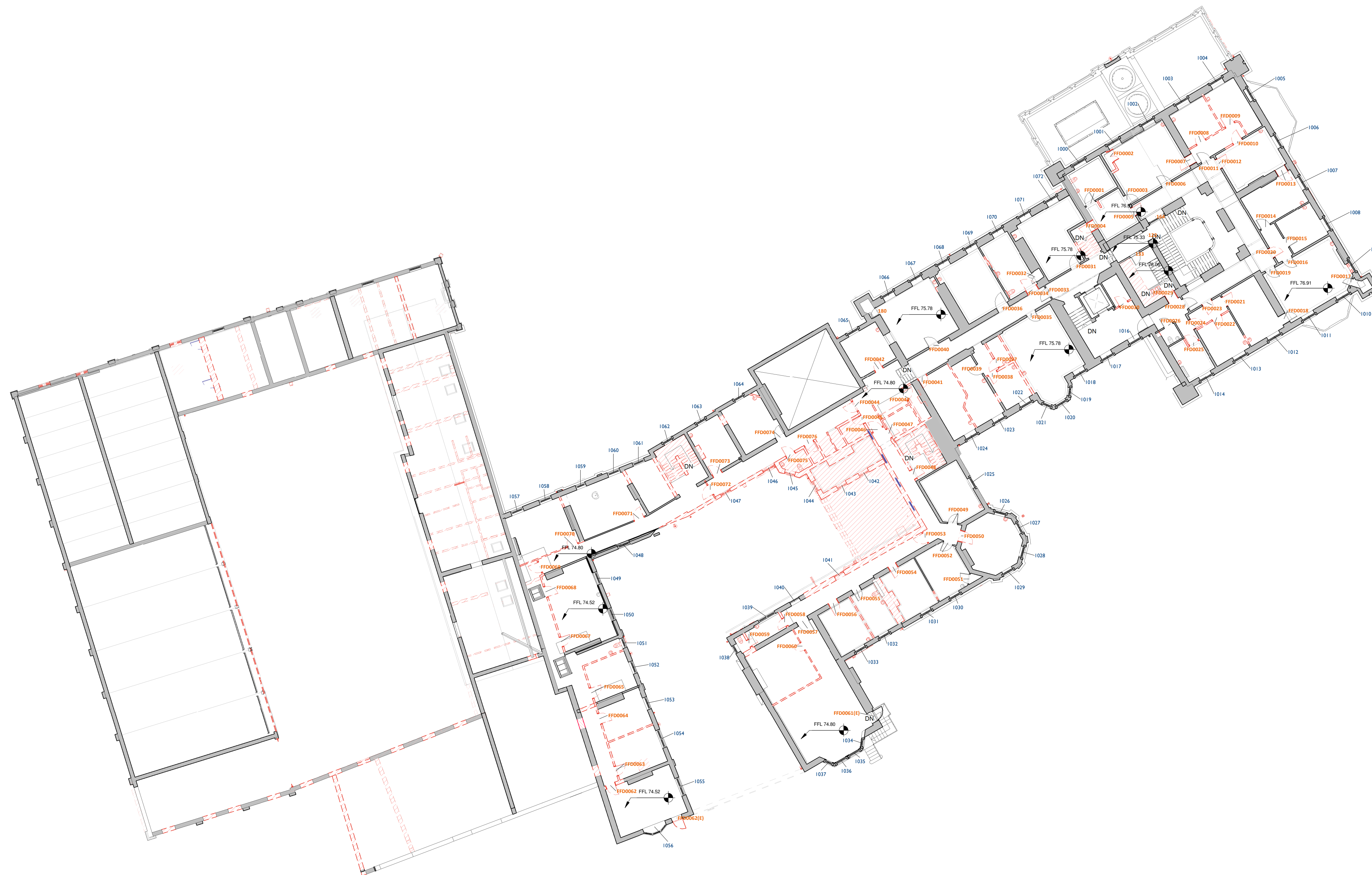
I Existing First Floor Plan 1004 1 : 200