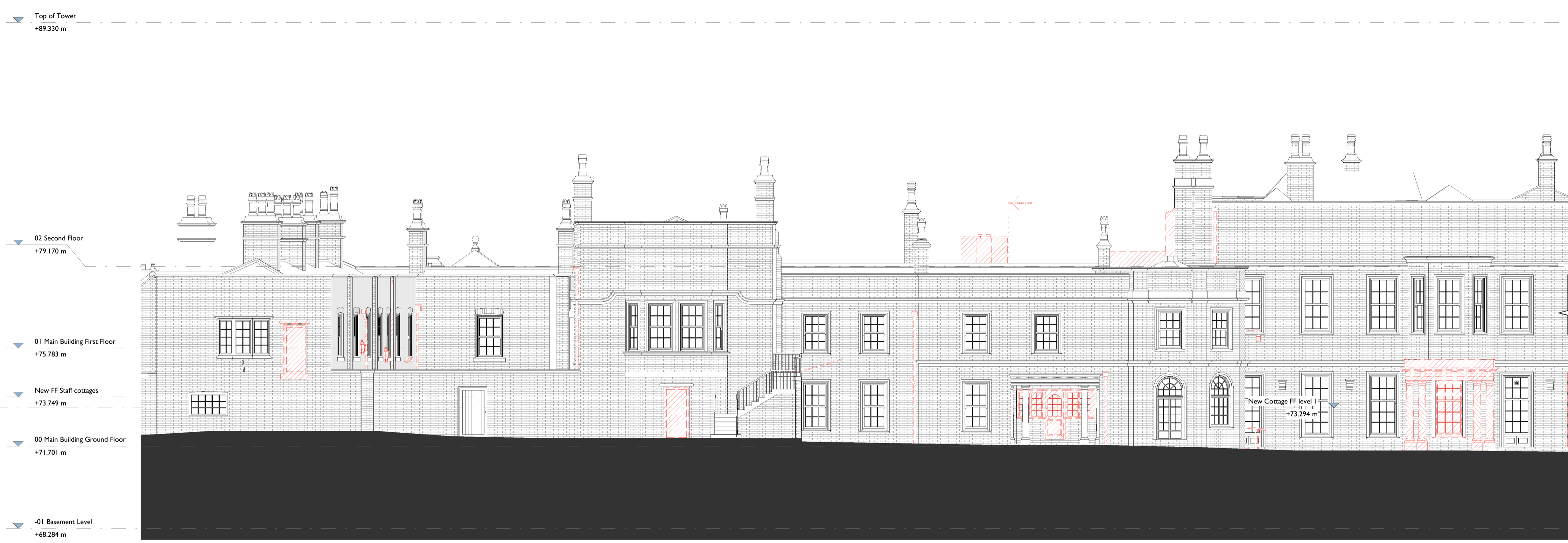
1 I1717 House Elevation 2 (HE2) as Existing Demolition 1 : 100