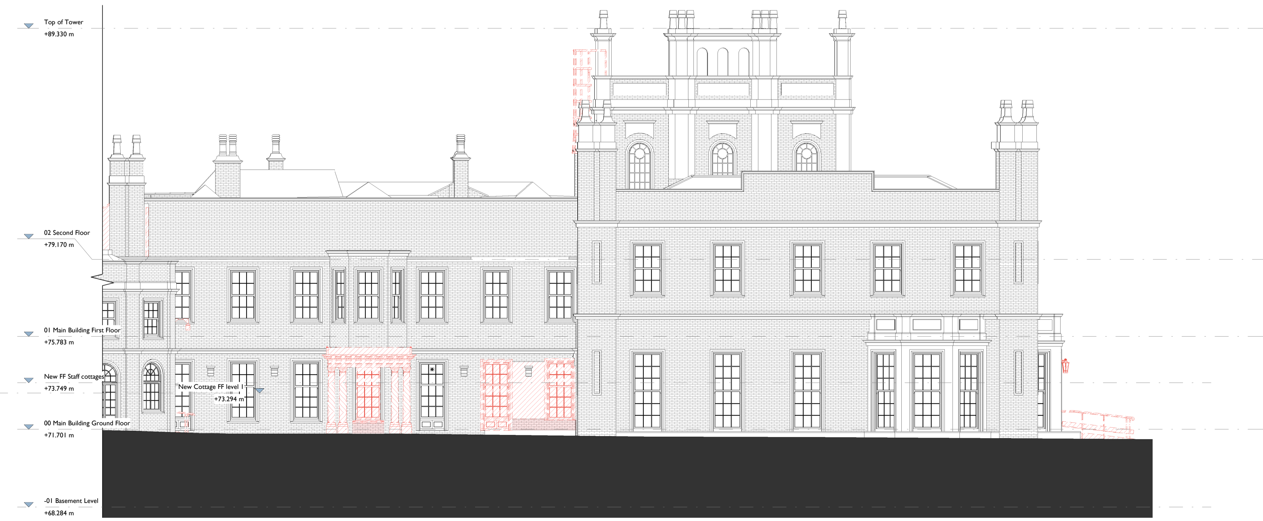
2 I1717 House Elevation 2 (HE2) as Existing Demolition 2 1 : 100

Notes: Drawings are based on survey data and may not accurately represent what is physically present. Do not scale from this drawing. All dimensions are to be verified on site before proceeding with the work. All dimensions are in millimeters unless noted otherwise. Purcell shall be notified in writing of any discrepancies.