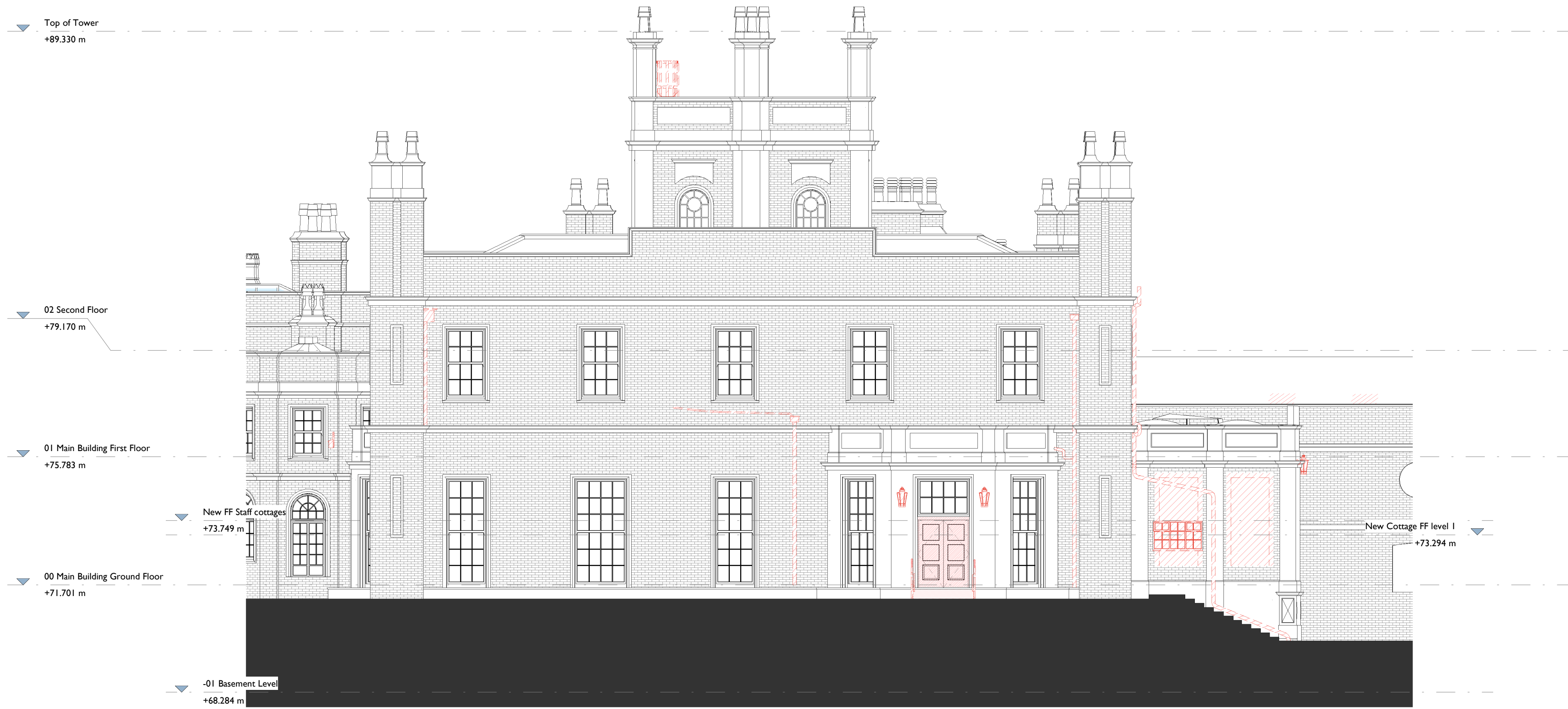
1 Wyatt Wing Elevation 1 (WE1) as Existing Demolition 1016 I : 100