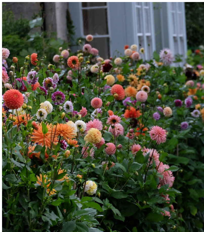
Example of cut flowers grown for indoor displays

A polytunnel, for more day-to-day use by the garden staff, has been located beyond the hedge boundary of the formal garden and is screened from view by typical Victorian shrubbery planting. This area would also provide space for a composting and maintenance area for the gardeners.