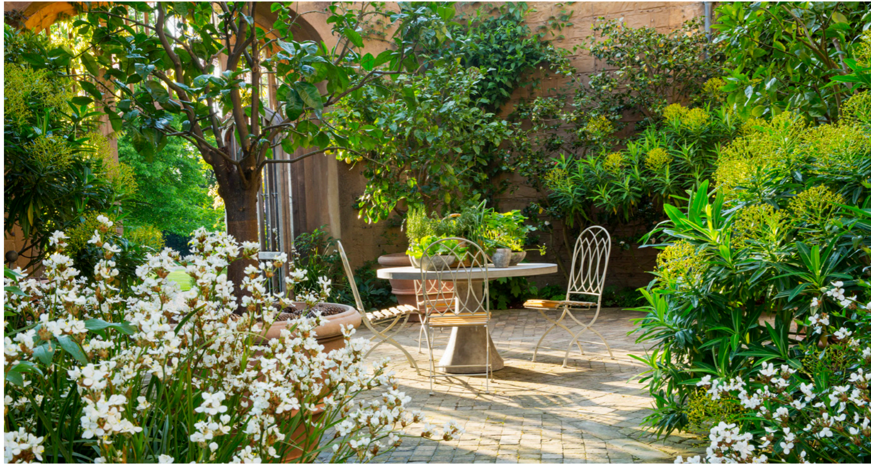
Example of planted courtyard - TSS project

The Spa courtyard would be largely used by friends, family and guests enjoying the swimming pool and leisure facilities and staying inside the guest cottages. We envisage this enclosed courtyard as one of the main nuclei of the property, a place for entertaining but also a more intimate and social space.