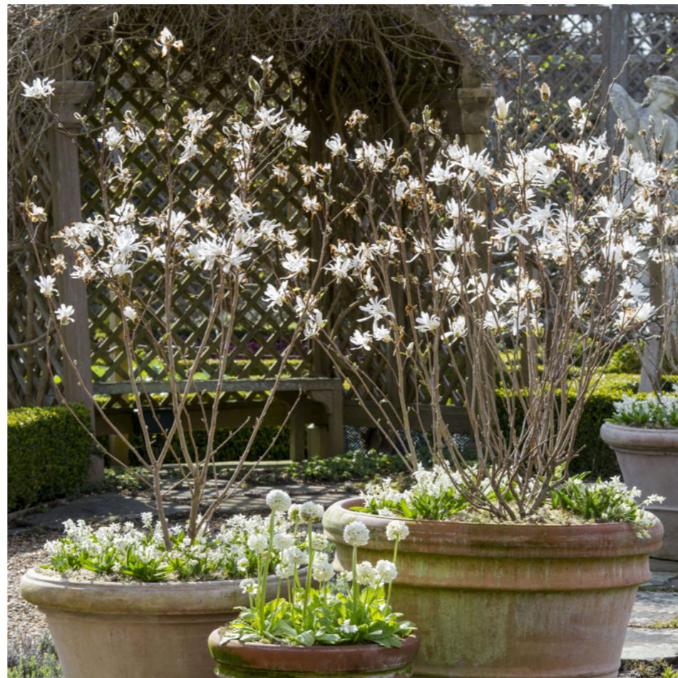
Collections of terracotta pots - TSS project