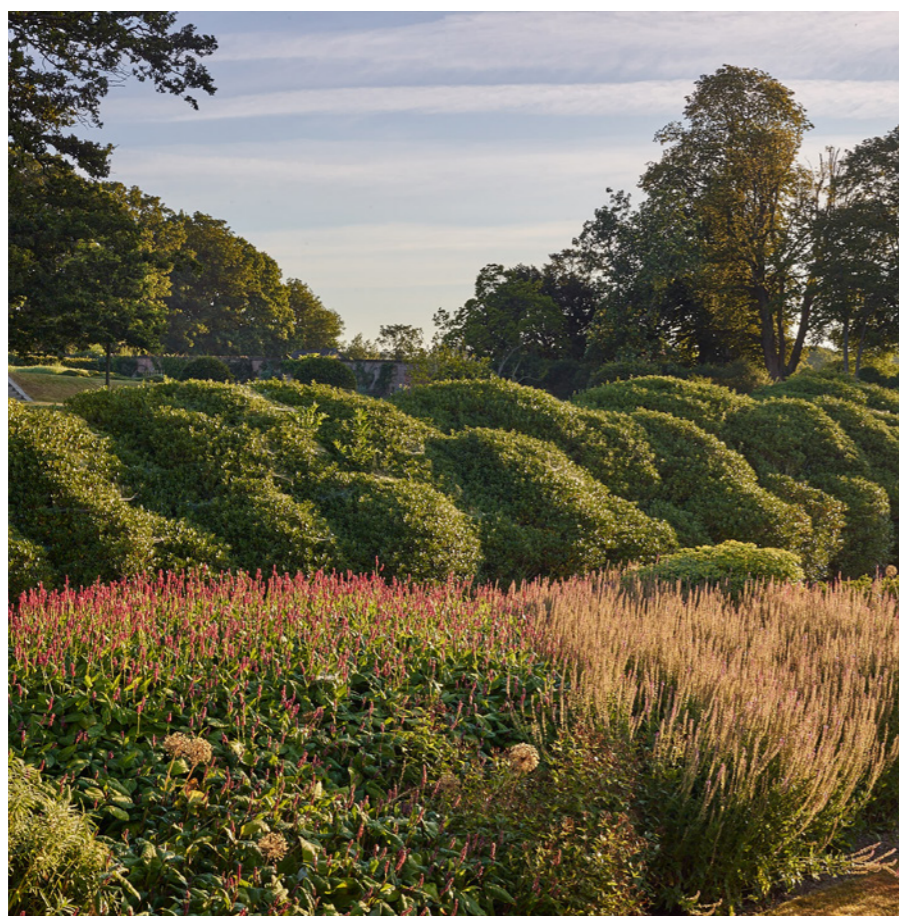
Cloud pruned hedge - TSS Project

Along the same axis a large cloud pruned feature hedge is proposed spanning the whole garden of either Yew or Osmanthus.