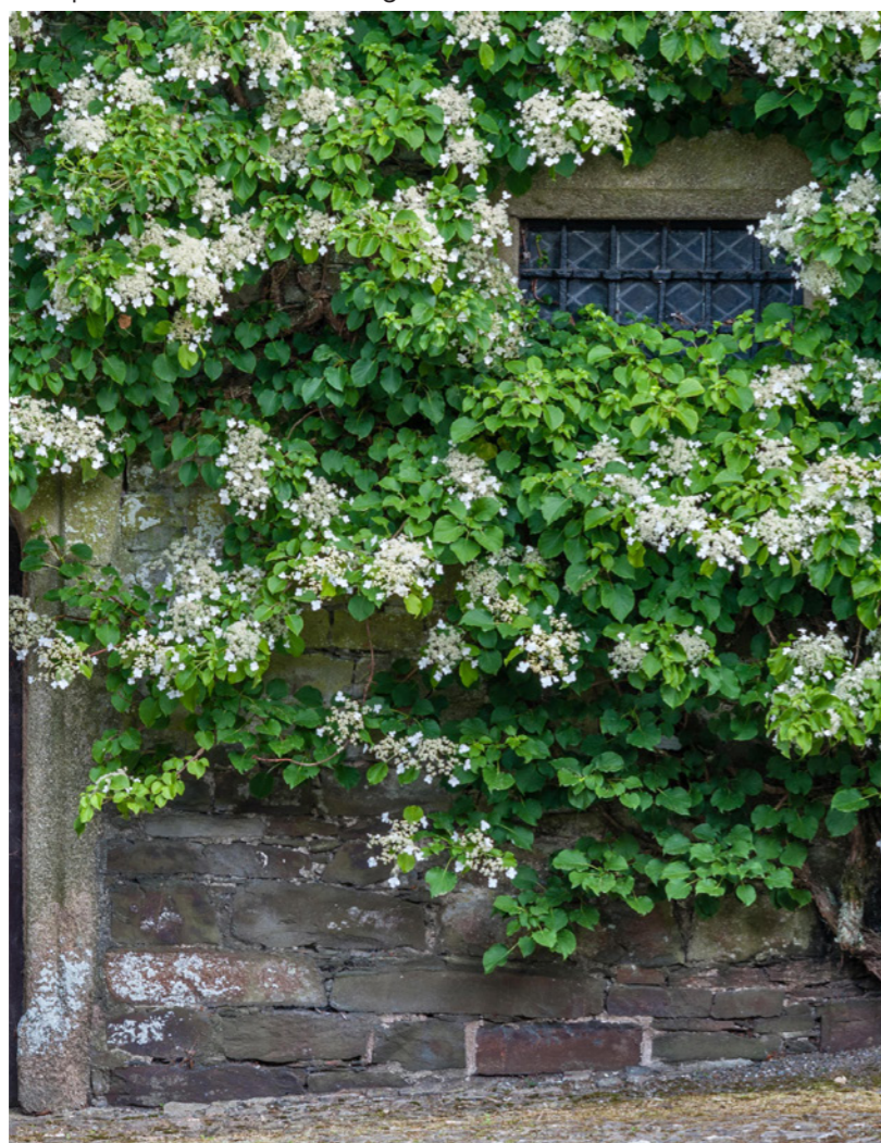
Hydrangea petiolaris climber