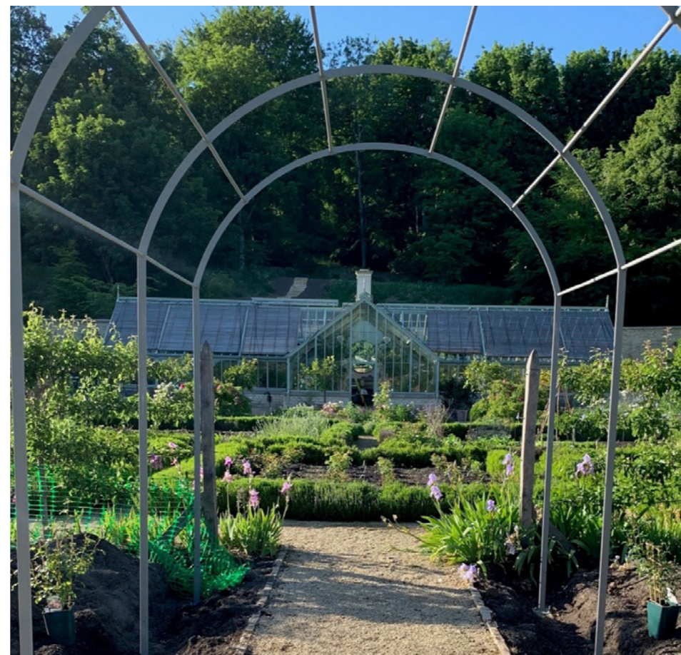
Example of presentation glasshouse - TSS project