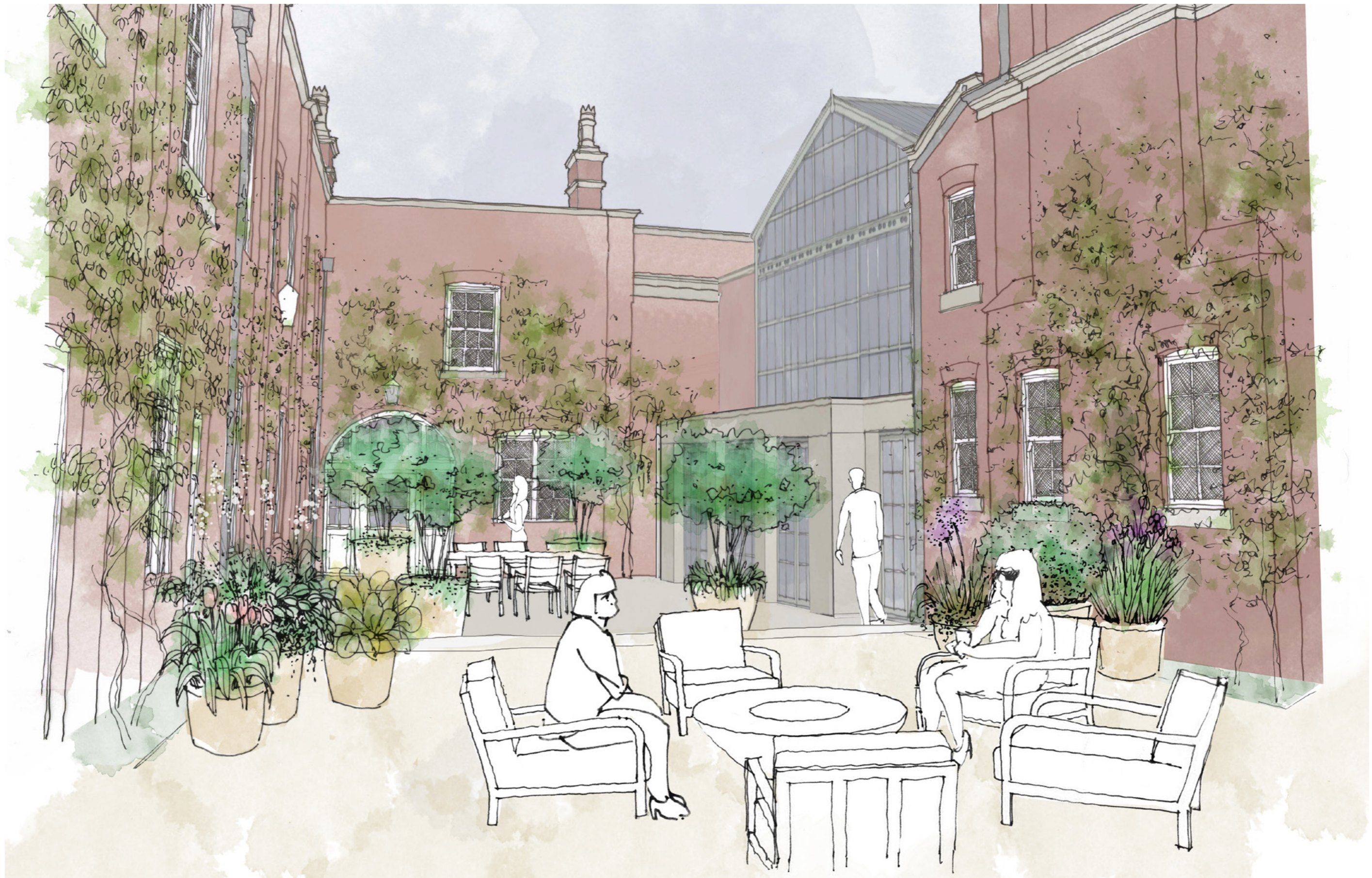
Hand drawn sketch of spa courtyard facing north