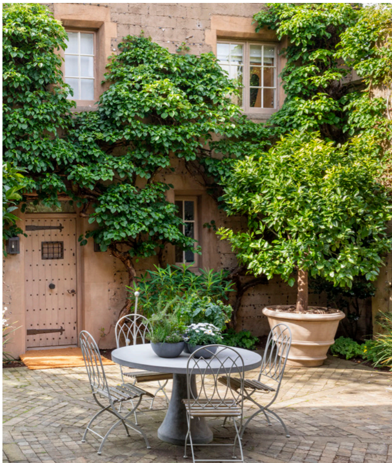
Example of courtyard and climbing plants - TSS project Cuerden Hall - Landscape Design Statement

Narrow planting beds around the whole garden allow for numerous and verdant climbers over all the facade walls. Large pots are to include specimen feature trees in front of the swimming pool, whilst in other areas small clusters of pots create a more informal and relaxed feel around a central seating area and fire pit.