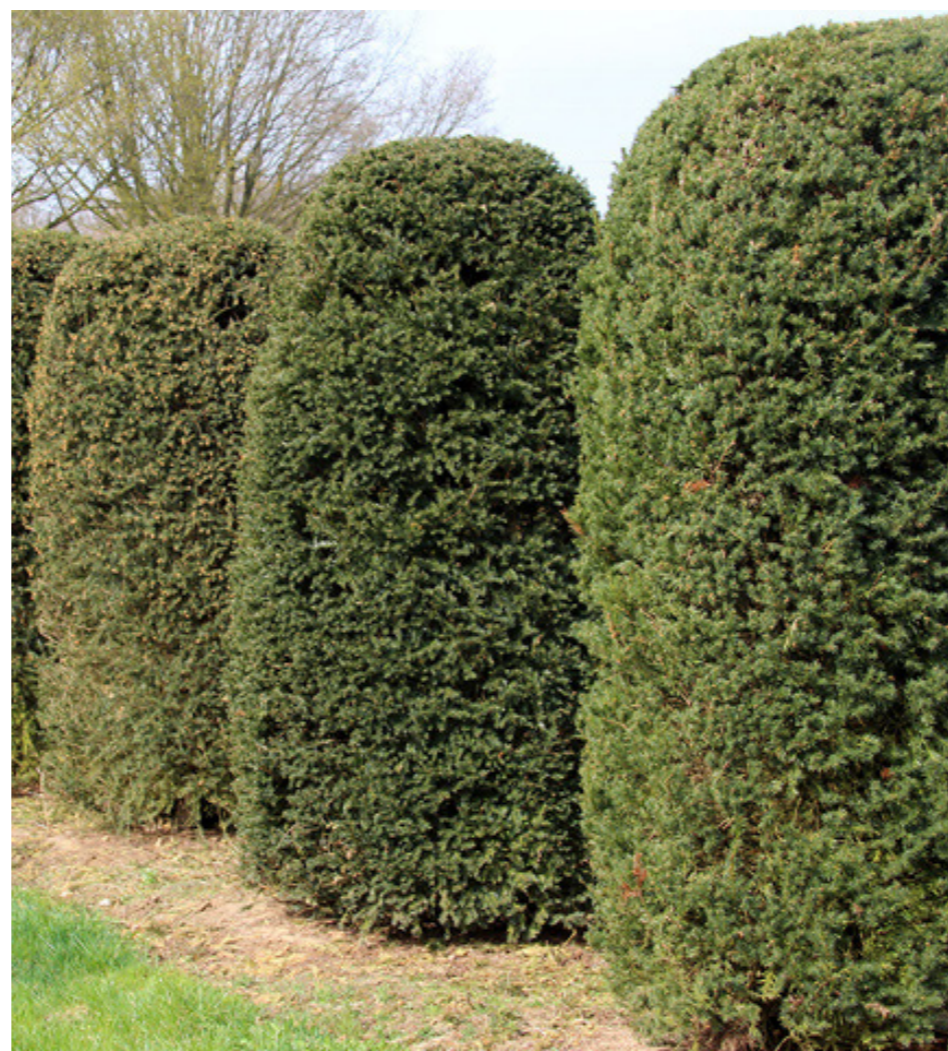
Example of beehive topiary