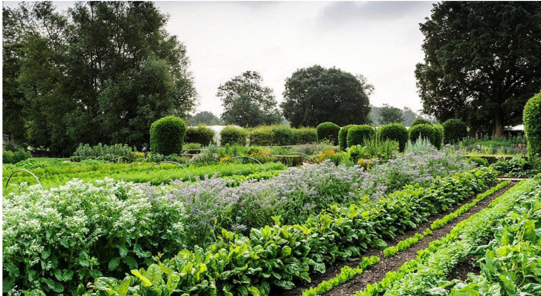
Example of productive beds

A productive garden is proposed to supply the household with fruit and vegetables as well as cut flowers. Both areas are arranged with a formal and regular layout, and have been designed to be both practical for the gardeners as well as beautiful.