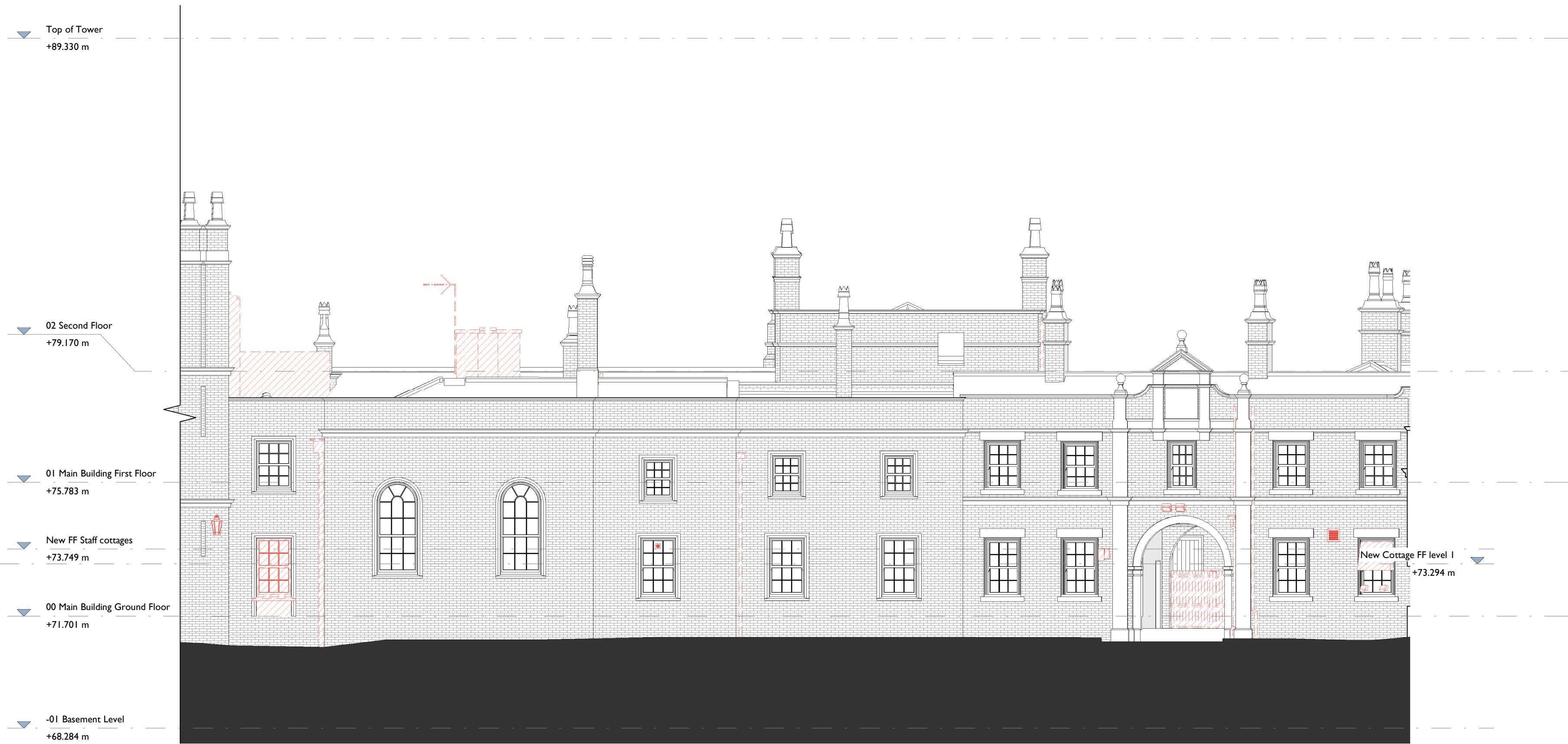
2 1717 House Elevation I (HE1) as Existing Demolition 2 1013 1 : 100

Notes: Drawings are based on survey data and may not accurately represent what is physically present.