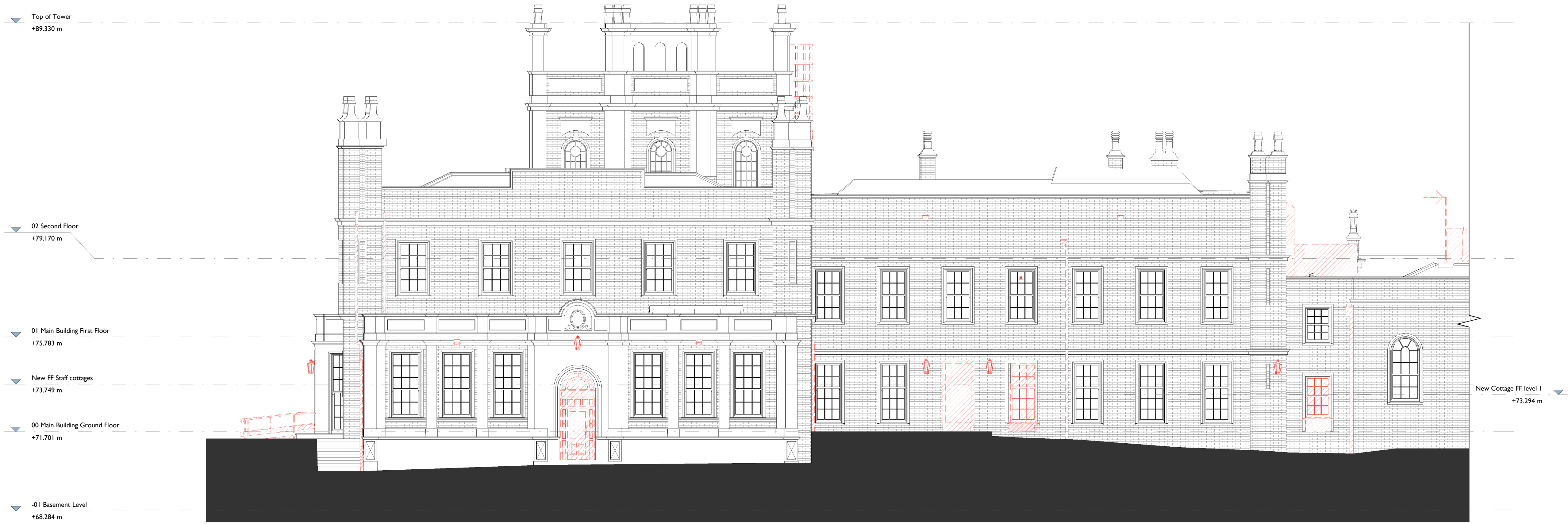
1 1717 House Elevation I (HE1) as Existing Demolition 1013 1 : 100